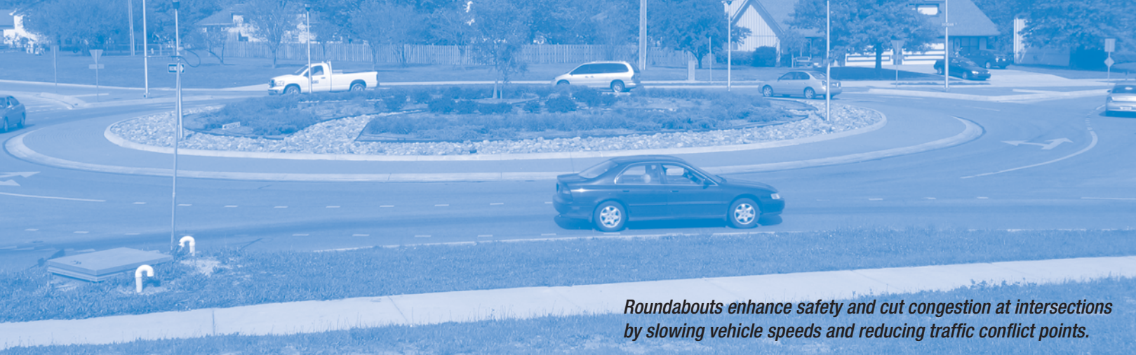
Roundabouts enhance safety and cut congestion at intersections by slowing vehicle speeds and reducing traffic conflict points.