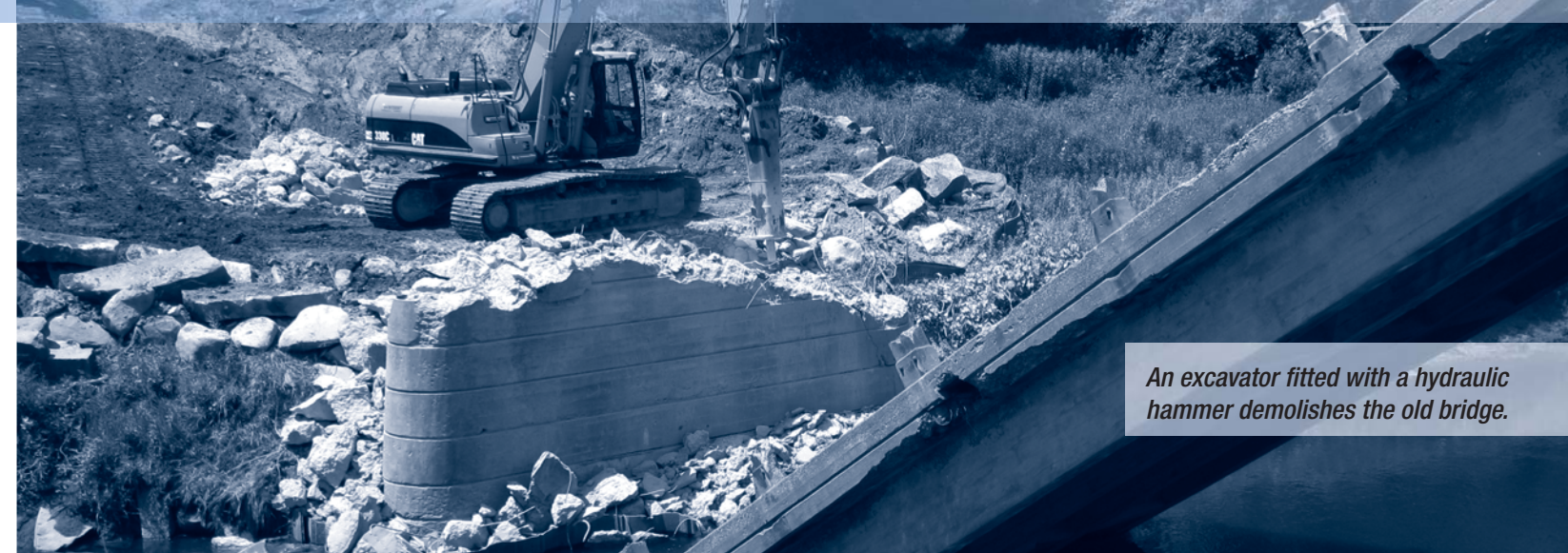
An excavator fitted with a hydraulic hammer demolishes the old bridge.