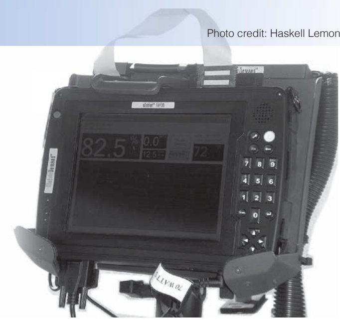
The Intelligent Asphalt Compaction Analyzer measures asphalt pavement density in real time, allowing equipment operators to fix problems before the asphalt hardens.