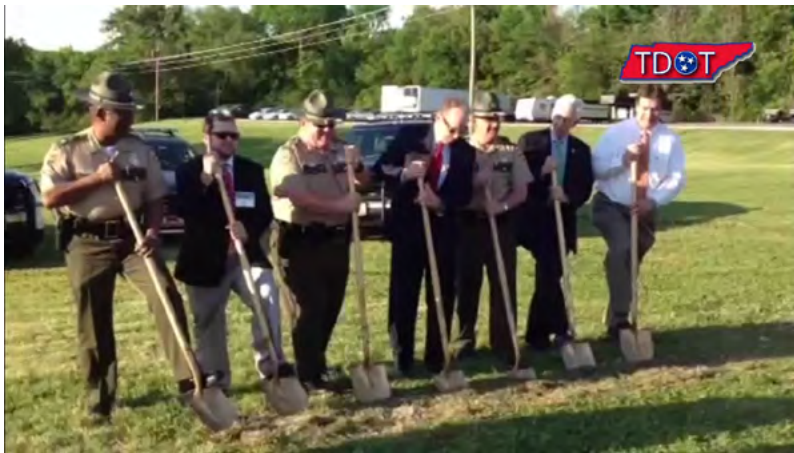
Tennessee's traffic incident management facility

The Tennessee Department of Safety and Homeland Security and the Tennessee Department of Transportation are building the first traffic incident management training facility in the country. The Nashville facility will be used to teach emergency