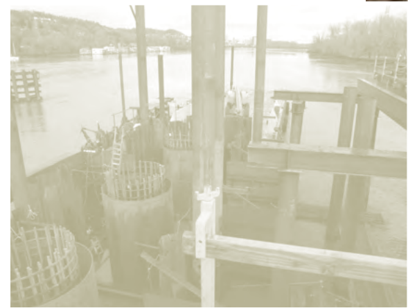
Perched box caissons are a money-saving idea that resulted from early contractor involvement.