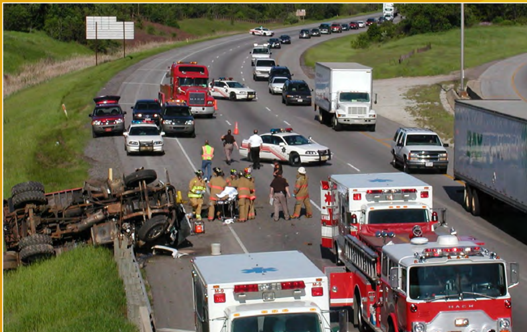
▲ First responders work to clear an incident on a Wisconsin interstate.