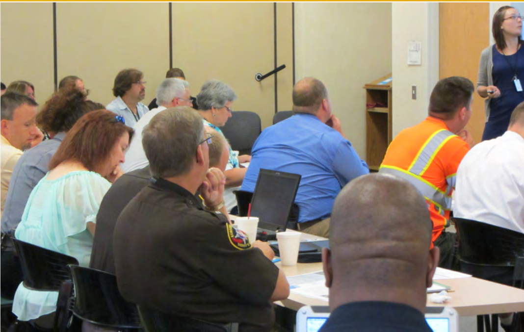
Regional TIME meeting participants review incidents and share ideas.