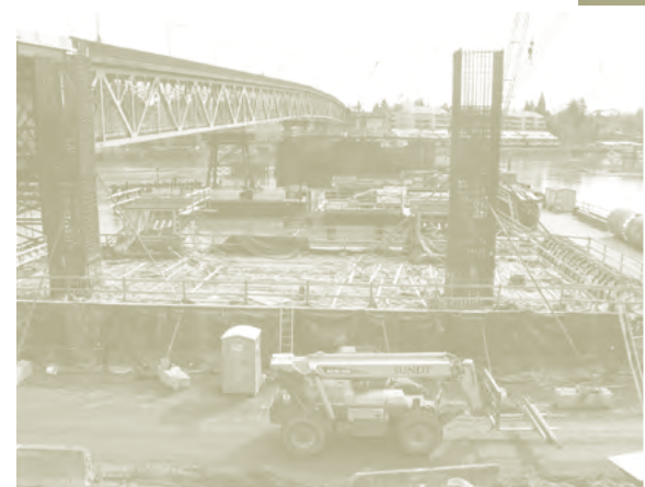
Foundation work is under way for the new bridge.