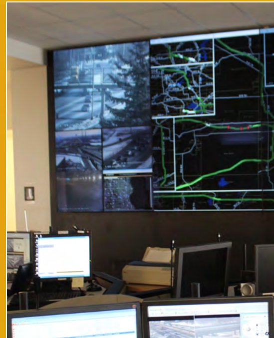
Wisconsin's Statewide Traffic Operations Center in Milwaukee features a video wall with a congestion map.