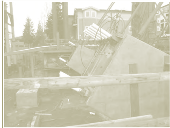
Crews install arch rib anchor bolts.