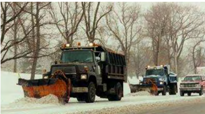
Road condition information enables agencies to use resources efficiently.