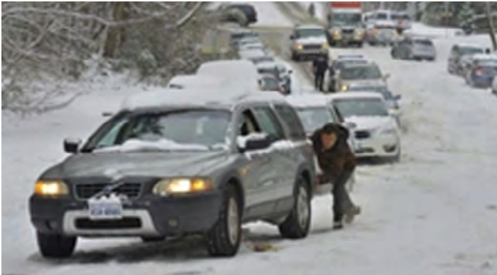
Snow can have significant impacts on the safety of travelers.