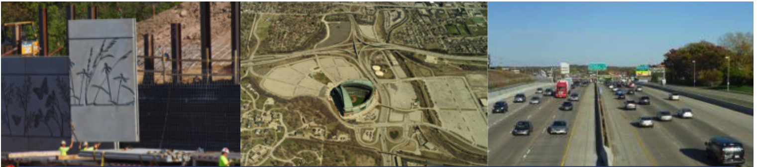
The Wisconsin Department of Transportation (WisDOT) is managing a series of complex projects (left to right): the Zoo Interchange, I-94 E-W Corridor Replacement, and the Madison Beltline