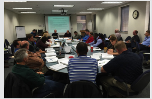
WisDOT staff attends a 1.5 day Train the Facilitator Training in Milwaukee, Wisconsin

The WisDOT participants learned about 5DPM strategies and how to begin integrating them into their organization. Then they applied 5DPM tools and methods to existing complex projects. Participants split up into three groups, each focused on an individual WisDOT project. One group explored the Madison Beltline project, which is outlined in the Project Snapshot. This case study uses the Madison Beltline project to explain the 5DPM exercises and their implementation benefits.