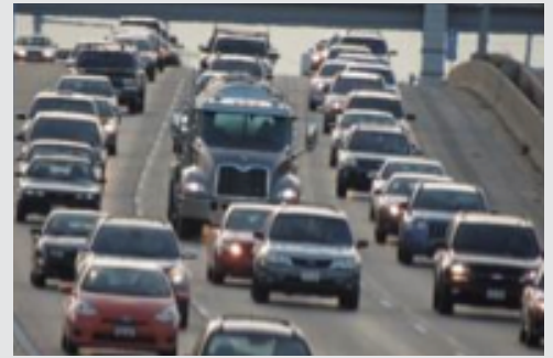
Up to 112,000 vehicles travel per day on the Madison Beltline through neighborhoods, natural areas, and business districts