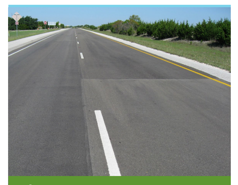
Advanced, proven preservation practices can help extend the overall service life of pavements.

Just as pavements differ, so do pavement preservation treatments. There is an array of different analyses, treatments, and construction methods that can help infrastructure owners achieve and sustain a desired state of good repair for their transportation facilities—despite tight budgets.