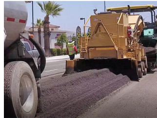
Pavement Recycling Systems