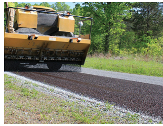
Slurry Pavers, Inc.

Six asphalt and three concrete pavement preservation treatments were discussed in depth (see Figures 1–9). All four states use chip seals and micro surfacing as asphalt preservation treatments. The next most commonly used treatments are ultrathin bonded wearing courses, CIR, and partial-depth repairs. Cape seals and scrub seals are not routinely used treatments for AC pavements. Precast full-depth repairs are used in high-density urban areas where access to local businesses is a concern and limited construction time is available.