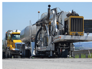
International Grooving and Grinding Association