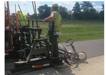
Strawser Construction Inc.