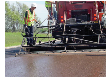
National Center for Pavement Preservation