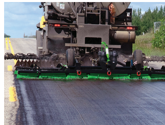
Saskatchewan Ministry of Highways and Infrastructure