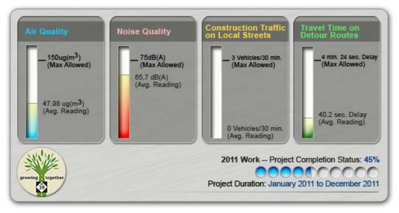
Snapshot of M-39 Project Performance Measure Dashboard