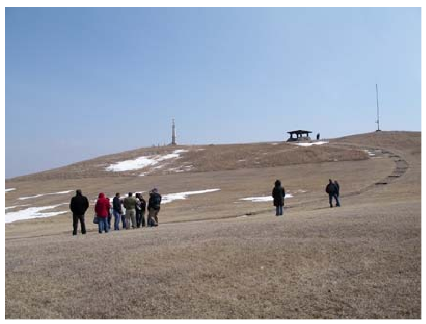
Fieldtrip participants at Whitestone Hill.