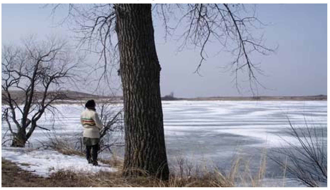
Unidentified Fieldtrip participant contemplates the lake at Whitestone Hill Battlefield State Historic Site. Soldiers tossed heavy metal objects including kettles and cooking utensils into the lake so that they could not be retrieved.