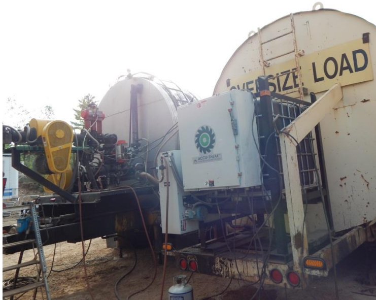
Figure 6. Water injection unit for WMA at the asphalt plant.

several years. In fact MDOT inserts into every project a special provision specifically calling out WMA as an allowed option for all asphalt pavements.