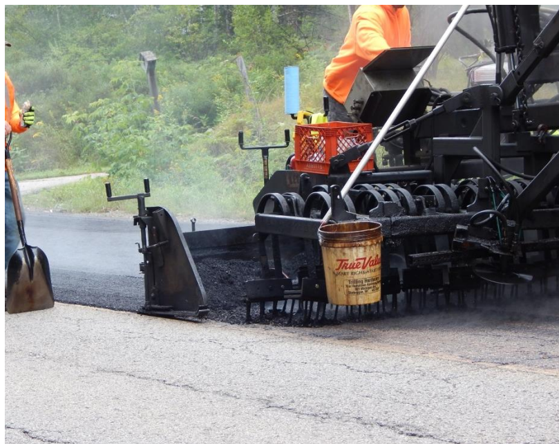
Figure 5. Recycle in place tines & screed.

The use of RIP not only sped up construction which means less disruption for the motorist and more worker safety, but also fully recycled the existing pavement, reducing the need to provide new and virgin materials for the asphalt and substantial reduces cost.