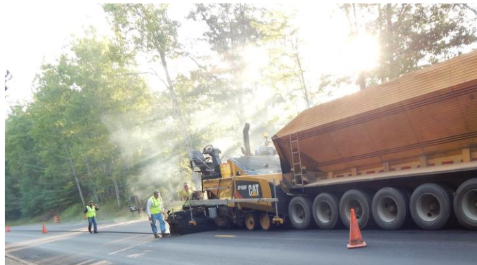
THE PROGRESSIVE CITY