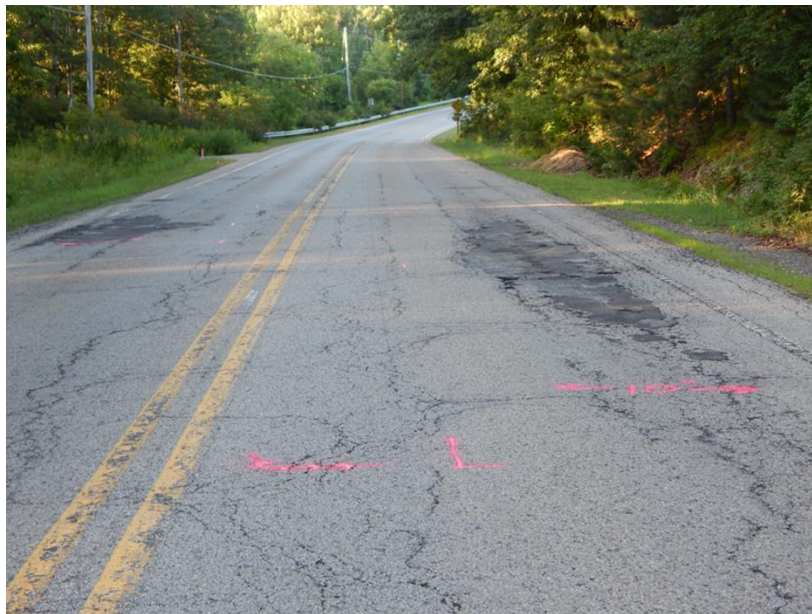
Figure 4. Failed areas of the existing pavement.

Traditionally, a road with a failing pavement such as this would be repaired by the crush, shape, and repave method. An overlay would buy it life, but with the wheel path cracking & rutting, the overlay wouldn't last long enough to satisfy the public.