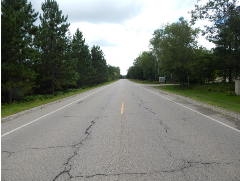
Figure 3. Block cracking.