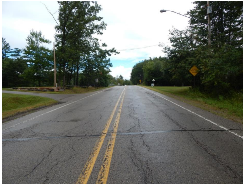
Figure 2. Wheel path cracking & rutting.

The pre-construction condition of the road showed wheel path cracking and rutting was abundant. The road was also showing block cracking. Some small areas of the pavement had completely failed.