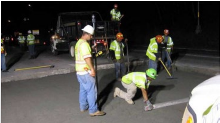
Crews worked at night to limit traffic disruption when they rehabilitated pavement on a busy Virginia interstate.

The project also demonstrated the value of good preparation and planning in achieving success, according to the report. Trial installations helped the Virginia DOT evaluate and become more comfortable with using PCPS technology. Planning for construction mobilization and