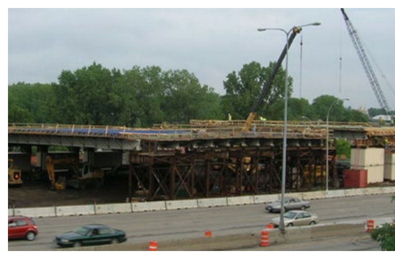
The Minnesota DOT adopted accelerated bridge construction techniques to speed construction and minimize traffic disruption on its Maryland Avenue Bridge project.

Plans called for the two-piece superstructure to be rolled in during an August weekend closure of I-35E, with all ramps and ancillary work scheduled to be completed shortly after. The Minnesota DOT estimated that using SPMTs would reduce Maryland Avenue closure time by 25 percent compared with a conventional construction approach.