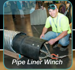
Pipe Liner Winch