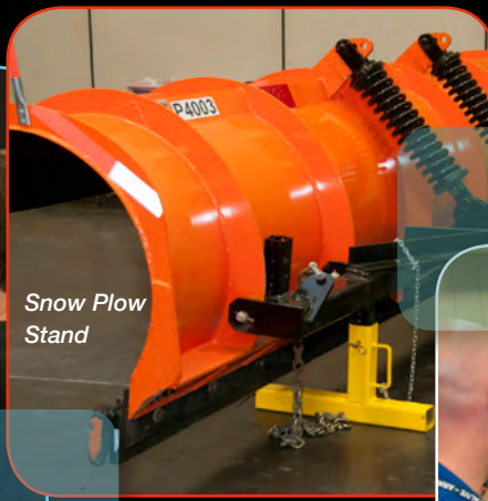
Snow Plow Stand