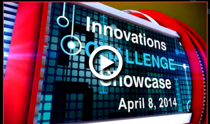
Missouri DOT 2014 Innovations Challenge Showcase

"Our innovative culture at MoDOT has evolved during the 27 years that I have worked here," he said. "When I first started here, our thinking was to wait and see what other states were doing. Now there is an expectation by our management that Missouri will be a leader in innovations among all of the DOTs. I wouldn't want to sell this program as creating an innovation culture because the program is a support for innovations that occur every day here!"