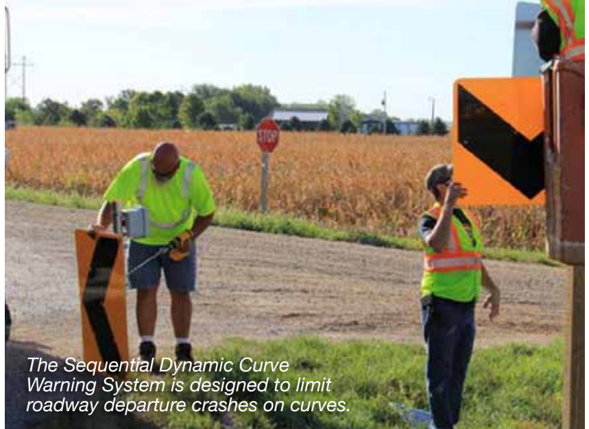
The Sequential Dynamic Curve Warning System is designed to limit roadway departure crashes on curves.