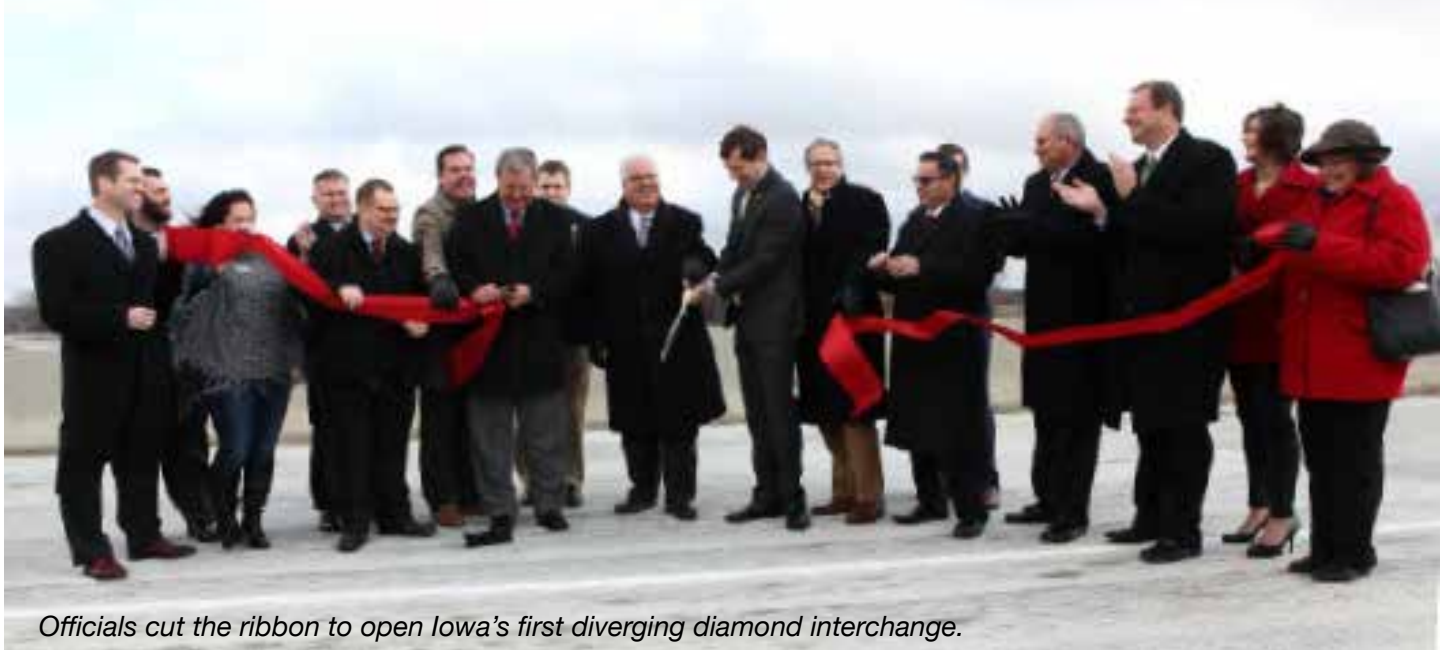
Officials cut the ribbon to open Iowa's first diverging diamond interchange.

The Michigan Department of Transportation conducted a road safety audit on I-94 from Jackson County to the Indiana state line. The RSA—a formal safety performance examination by a multidisciplinary team—was initiated after the corridor experienced a 193-vehicle pileup in winter 2015. The RSA report recommendations include applying high-friction surface treatment on select pavement areas to enhance safety. Representatives of the Michigan State Police, FHWA, Wayne State University and other organizations helped conduct the RSA.