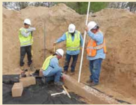
An Ohkay Owingeh road crew used GRS-IBS to replace the White Swan Bridge.