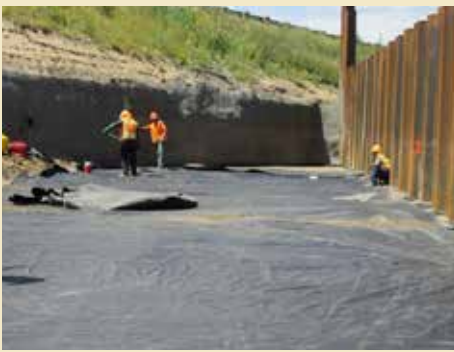
Crews place geosynthetic fabric on the I-70 GRS-IBS project in Colorado.