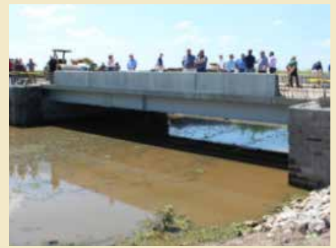
Transportation professionals observed GRS-IBS construction at a Louisiana showcase.