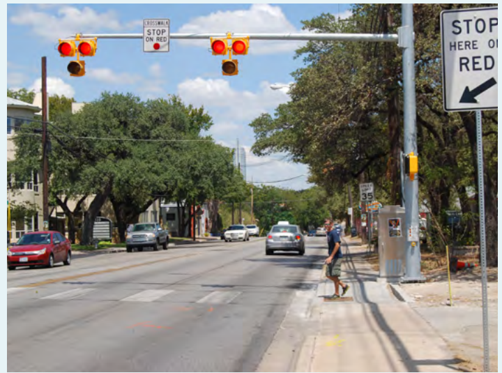
Pedestrian hybrid beacons enhance safety for walkers crossing multilane roads in Austin, TX.

“FHWA is here to STEP agencies through the process and provide technical assistance on developing policies or processes, selecting countermeasures or projects, prioritizing, and leading road safety audits ,” said Crowe. “We also offer training and workshops, which can be a 1-day workshop with a field exercise