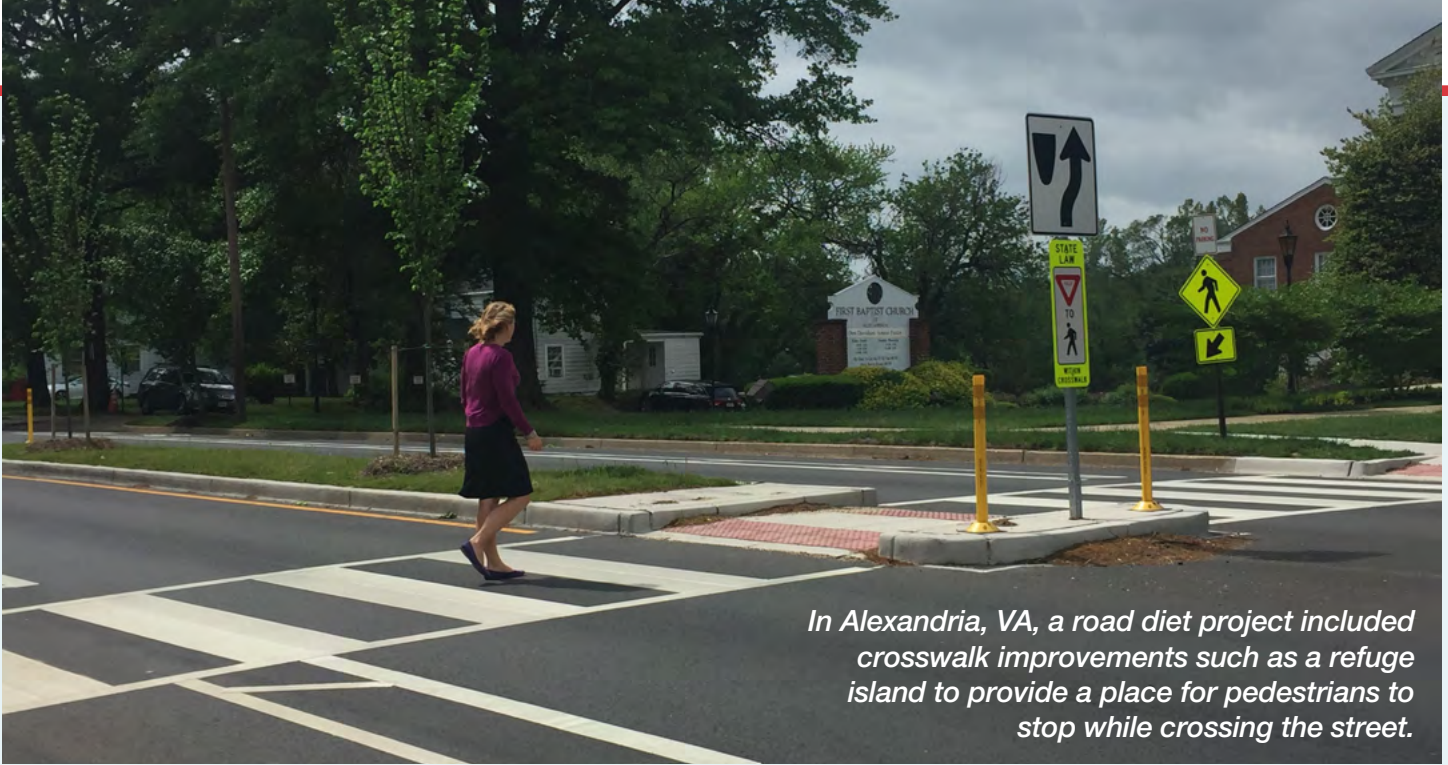
In Alexandria, VA, a road diet project included crosswalk improvements such as a refuge island to provide a place for pedestrians to stop while crossing the street.