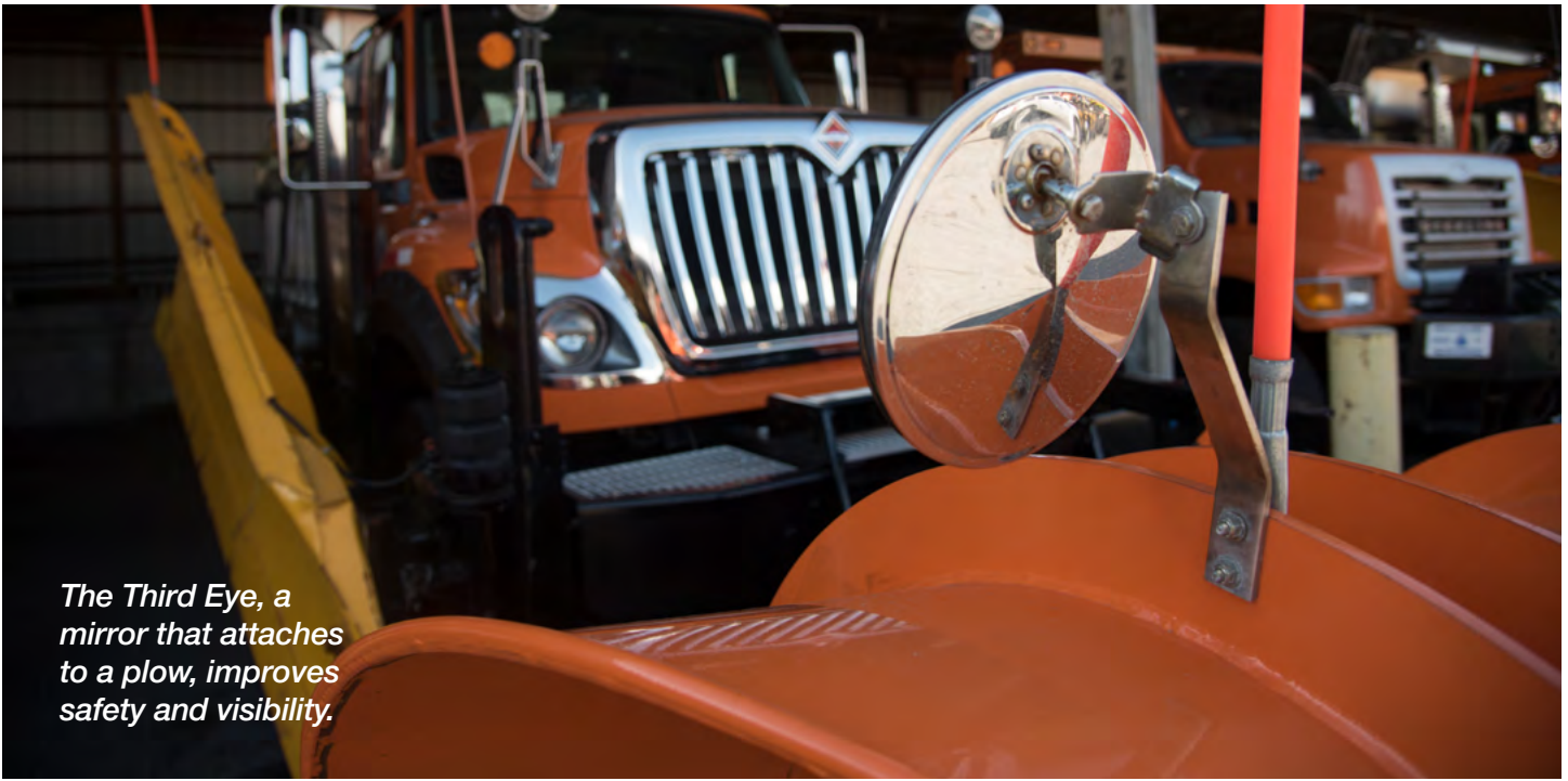
The Third Eye, a mirror that attaches to a plow, improves safety and visibility.