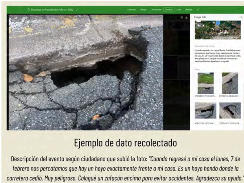
Ejemplo de dato recolectado

The Municipality developed the public survey tool using Survey 123 from ArcGIS. Annual cost for the license is $440.