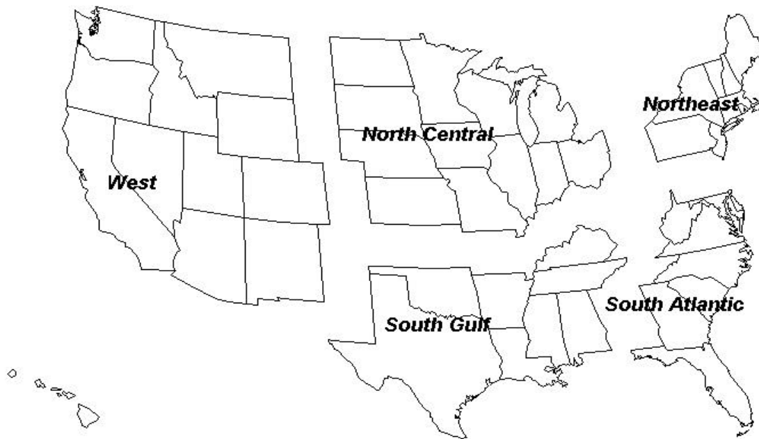
Estimated Vehicle-Miles of Travel by Region - May 2003 - (in Billions)

Travel on all roads and streets changed by -0.2 percent for May 2003 as compared to May 2002.