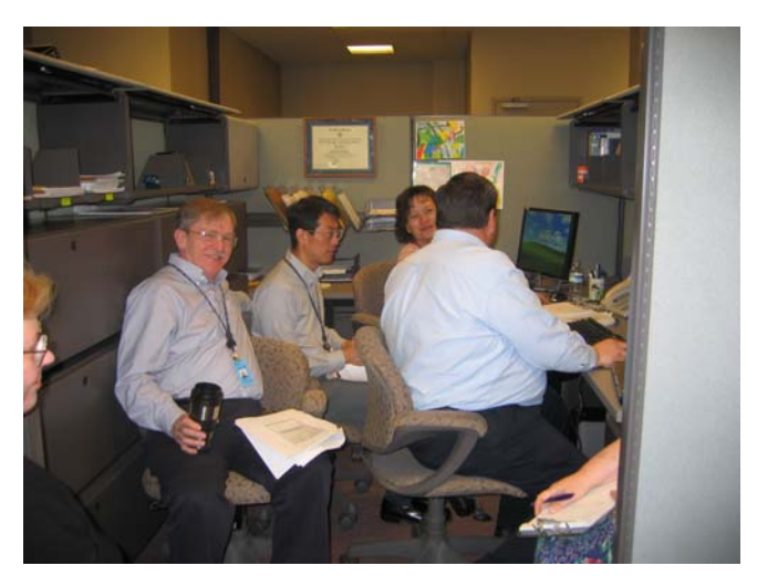
Figure 2. Training Session for LTPP Server Procedures

This spring, the LTPP program successfully completed the transfer of the LTPP Information Management System (IMS) server from the Technical Support Services Contractor (TSSC) in Oak Ridge, Tennessee, to the new LTPP Information Center at the Turner-Fairbank Highway Research Center in McLean, Virginia. Everything went smoothly, and the TSSC staff did a great job of setting up the system and training LTPP Team members on basic Oracle database operations.