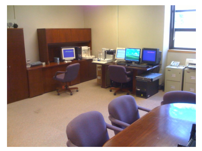
Figure 3. The LTPP Information Center

• The LTPP Reference Library which contains documentation on experimental planning, data collection guidelines, testing procedures, data processing and storage, as well as research reports, construction and installation reports, and products and their supporting documentation.