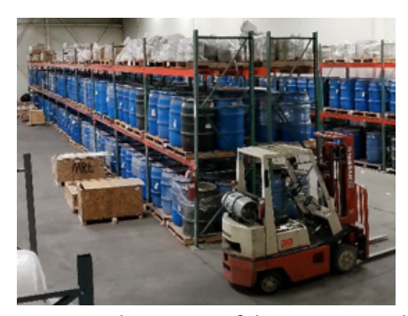
Figure 2. Photo. View of the new Materials Reference Library facility.

The LTPP Materials Reference Library (MRL) successfully relocated to a new location in Reno, NV, in April 2019. After the move, a significant effort went into reorganizing inventory to optimize operations. Several improvements to the facility were made, such as replacing old, noncode-compliant racking systems with new ones. The facility is fully operational and ready to respond to researchers' material requests. The MRL houses a wide variety of pavement material from the LTPP test sections and other experiments, such as WesTrack and the Asphalt Research Consortium. For more information about the MRL, go to the MRL page on LTPP InfoPave, or contact Larry Wiser at <a href="mailto:larry.wiser@">larry.wiser@</a> dot.gov. We look forward to fulfilling your materials requests.