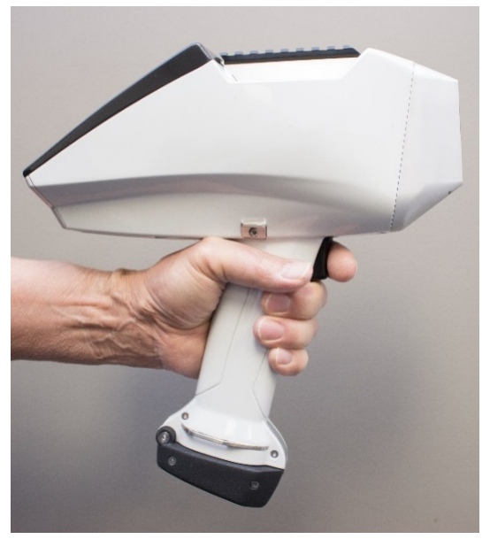
Figure 2. Handheld XRF Spectrometer

No sample preparation is needed except to ensure the sample is representative of the bulk. The nose of the handheld spectrometer is normally held against the sample. Since asphalt is sticky, the spectrometer head must be protected from the asphalt. This can be done by simply placing a thin plastic film—ideally those designed for assembling XRF cups—over the asphalt.