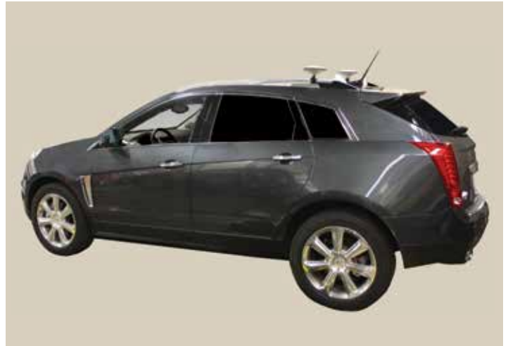
Test Vehicle Equipped with Cooperative Adaptive Cruise Control Technologies

The CACC implementation will provide the ability to test the open architecture of the vehicle fleet technology platform and assess the ability of researchers to use the vehicle fleet to support the study of operational concepts and connected automation applications.