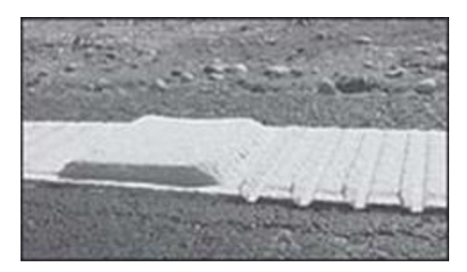
Figure 1. Photo. Raised profiled thermoplastic marking.<sup>(1)</sup>

There are two types of profiled markings—raised and inverted profile patterns—as shown in figure 1 and figure 2.