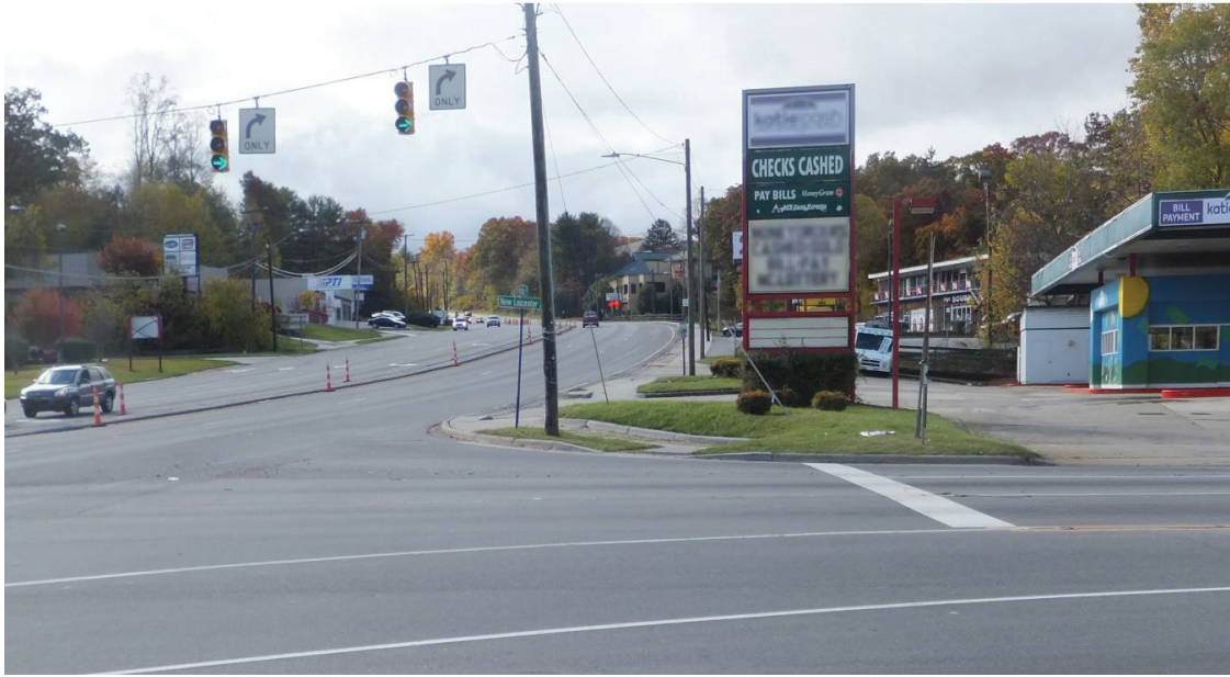
Figure 1. Photo. Signalized intersection with limited corner clearance.