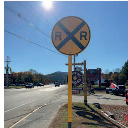
Figure 18. Photo. After treatment: Railroad Crossing sign with retroreflective 2.5-inch yellow strip.