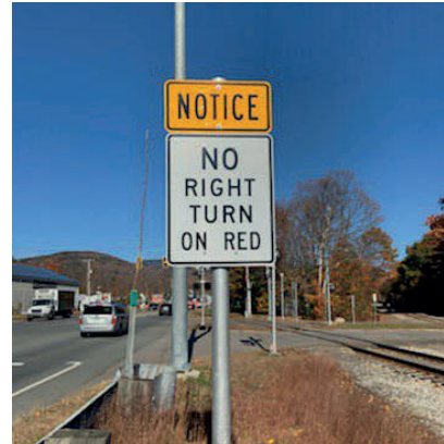
Figure 14. Photo. After treatment: fluorescent-yellow NOTICE header panel.