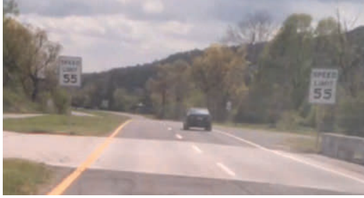
Figure 23. Photo. Conspicuity treatment: duplicate signs.