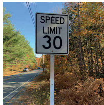
Figure 16. Photo. After treatment: sign with retroreflective white strip.