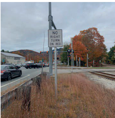
Figure 13. Photo. Before treatment: sign without header panel.