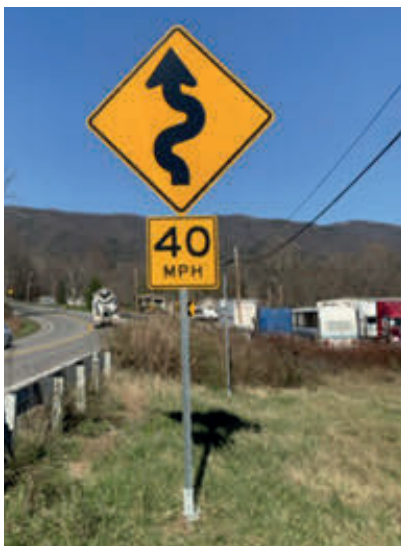
Figure 19. Photo. After treatment: oversized sign.

Figure 19 through figure 21 show examples of signs before and after treatments were installed.