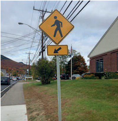
Figure 11. Photo. Before treatment: retroreflective 2.5-inch yellow strip.

Figure 11 through figure 18 show some examples of signs before and after the conspicuity treatments were applied.