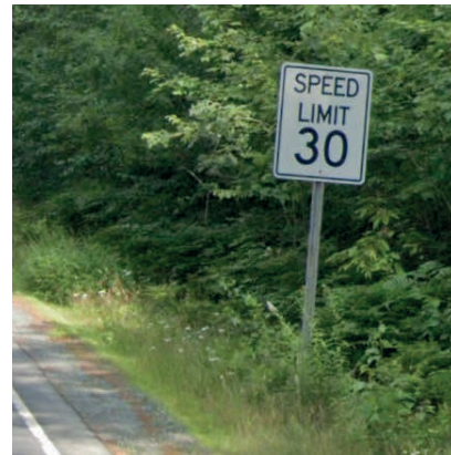
Figure 15. Photo. Before treatment: sign without retroreflective white strip.