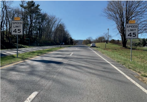
Figure 24. Photo. Conspicuity treatment: fluorescent yellow NOTICE header panels.