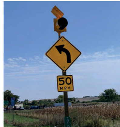
Figure 9. Photo. Treatment in Iowa: curve beacon.