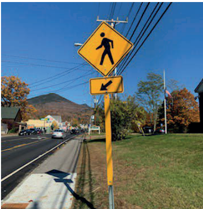
Figure 12. Photo. After treatment: retroreflective 2.5-inch yellow strip.