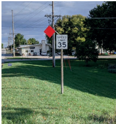
Figure 7. Photo. Treatment in Iowa: Speed Limit flag.