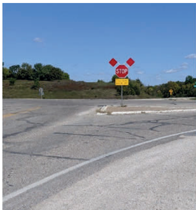
Figure 8. Photo. Treatment in Iowa: STOP-sign flags.