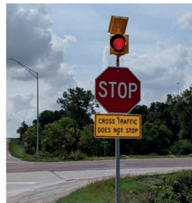
Figure 10. Photo. Treatment in Iowa: STOP-sign beacon.