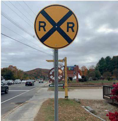
Figure 17. Photo. Before treatment: Railroad Crossing sign without retroreflective 2.5-inch yellow strip.