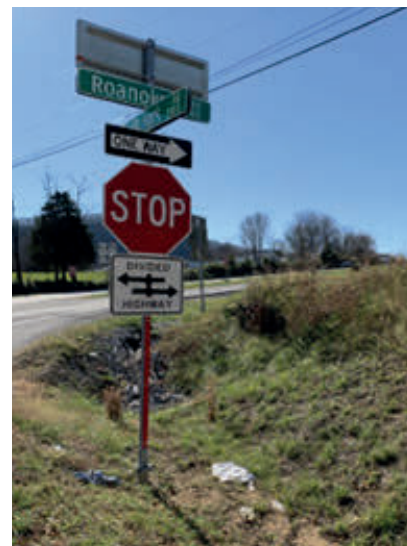
Figure 20. Photo. After treatment: red retroreflective strip.