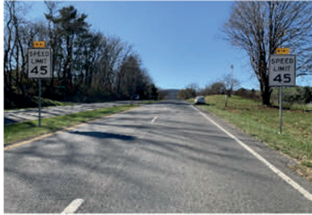
Figure 21. Photo. After treatment: fluorescent yellow NOTICE header panel.