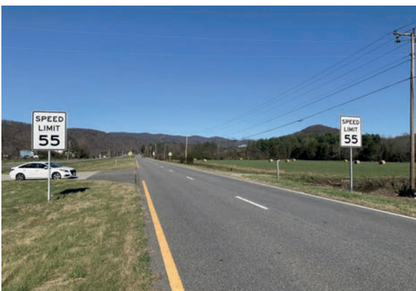
Figure 25. Photo. Conspicuity treatment: white retroreflective strip on signpost.