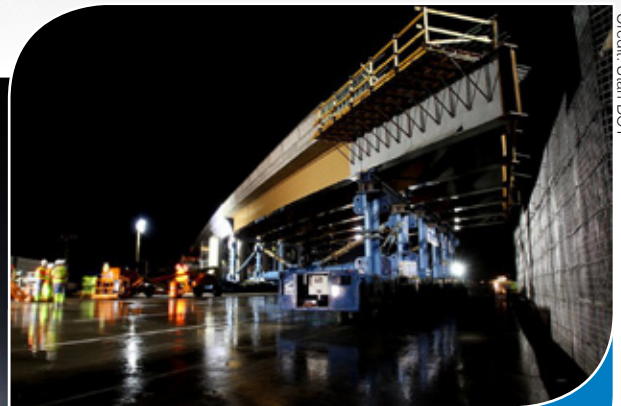
The bridge nears its final destination over I-15.