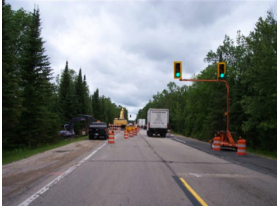
The contractor on a Michigan Highways for LIFE project opted to use self-adjusting temporary traffic signals to minimize motorist delay during construction.

whether they're in a department of transportation or in a management and budget office, to recognize that you may need to have some short-term pain to have long-term savings.