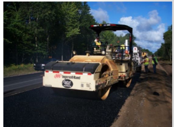
The use of performance contracting on the M-115 rehabilitation project enabled the contractor to offer a five-year pavement warranty.

Last January, Gov. Rick Snyder unveiled a Michigan Dashboard to tell people how we're doing. Two of those 20-some measures dealt with transportation, serious injuries and fatalities in crashes