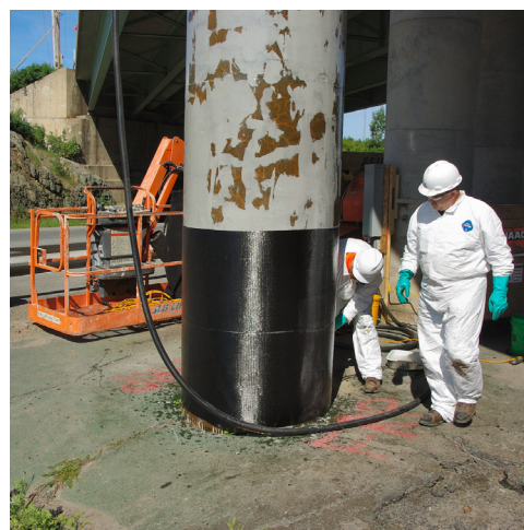
Figure 3. Application of CFRP wrap.

Once all treatments are completed, the team will commence monitoring activities for the duration of the program by the research team and Maine DOT. For more information about this field implementation project, please contact Gina Ahlstrom at Gina.Ahlstrom@dot.gov .