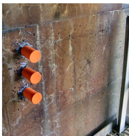
Figure 1. Instrumentation panel with embedded steel pins and marked grid. Orange cases enclose humidity probes at various depths.

To evaluate the efficacy of the treatments, the research team instrumented the bridge structures in late May to monitor the expansion of the structure, progression of cracking, and internal humidity. Steel pins were embedded in the structure to measure expansion and a grid was drawn on the surface of each instrumentation site to monitor the progression of surface cracking (see Figure 1). In addition, holes were drilled at 1, 2, and 3-inch depths in order to measure the internal humidity of the structure with humidity probes inserted at these various depths (see Figure 1).