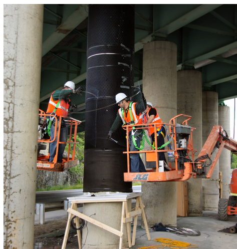
Figure 2. Application of titanium mesh for electrochemical treatment with lithium nitrate.

During the first week of June, the electrochemical treatment of one column (located on South Parkway over I-395) was initiated (see Figure 2). This treatment extends over a period of five weeks where a voltage is continuously applied between the concrete surface and the reinforcement in the structure to draw the lithium solution into the concrete.