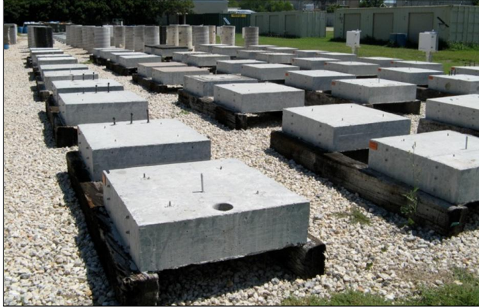
Figure 4. CDC outdoor exposure site.

In conjunction with ICAAR, the ASR Development and Deployment Program Technical Working Group (TWG) will meet on May 23 rd . The ASR TWG will discuss the overall progress of the program and provide an update on FHWA in-house research. Recent developments from the FHWA ASR Broad Agency Announcement (BAA) program, which seeks to advance the fundamental understanding of ASR, improve laboratory and field tests, and identify cost effective preventive and mitigation techniques, will also be presented.