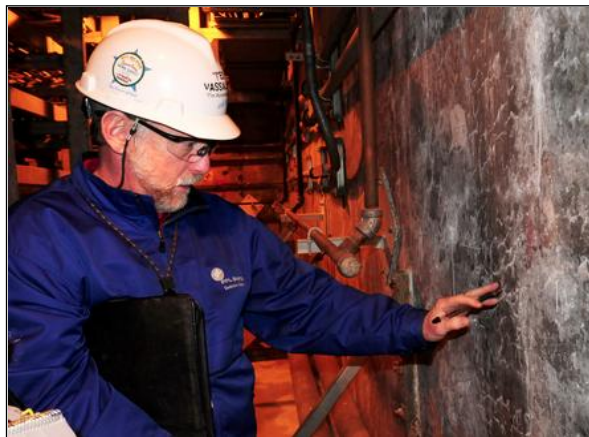
Figure 3. Tunnel affected by ASR.

It was not immediately apparent why ASR was discovered only recently. During the construction phase prior to the plant's opening in 1990, ASR was not predicted by the accepted test methods at the time, ASTM C289 (Standard Test Method for Potential Alkali-Silica Reactivity of Aggregates (Chemical Method)) and ASTM C295 (Standard Guide for Petrographic Examination of Aggregates for Concrete). However, ASTM C09.20 Committee on Normal Weight Aggregates has since cautioned that these tests may not accurately predict aggregate reactivity when dealing with a late or slow-expanding aggregate, which Seabrook engineers have confirmed was used to construct the tunnel.