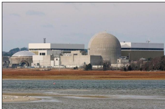
Figure 2. Seabrook Station.

Alkali-silica reactivity (ASR) was recently discovered at the Seabrook Station Nuclear Power Plant, becoming the first documented case of ASR at a United States nuclear facility. This plant is operated by NextEra Energy and is located on 900 acres of the southern New Hampshire seacoast, as shown in Figure 2. During a routine inspection, plant officials observed small, shallow cracks on the walls of an electric control tunnel (see Figure 3). The tunnel, which is roughly 100 yards in length and fully encased in concrete,