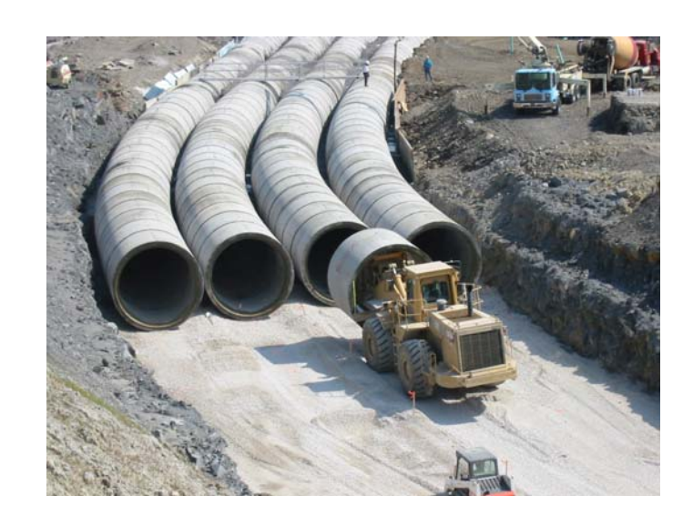
Four 120-inch reinforced concrete pipes being placed.

The flowable fill can be seen between the pipes.