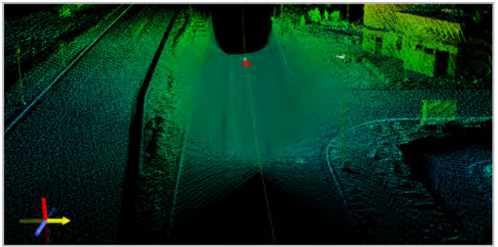
UDOT's integrated asset management program capitalizes on rapid advancements in technologies, data, and automation, including mobile LiDAR imaging for roadway asset inventory.

In October 2011, an RFP was advertised asking potential contractors to geo-locate a limited set of aboveground roadway features over 14,000 driven miles of roadway (referred to as the Roadway Imaging and Inventory Program). The RFP defined a two-step procurement process and a best-value selection approach. After an initial screening, the top three bidders provided a proof of concept-type demonstration on two different types of roadway sections and met for one full day to explain their software and user interface.