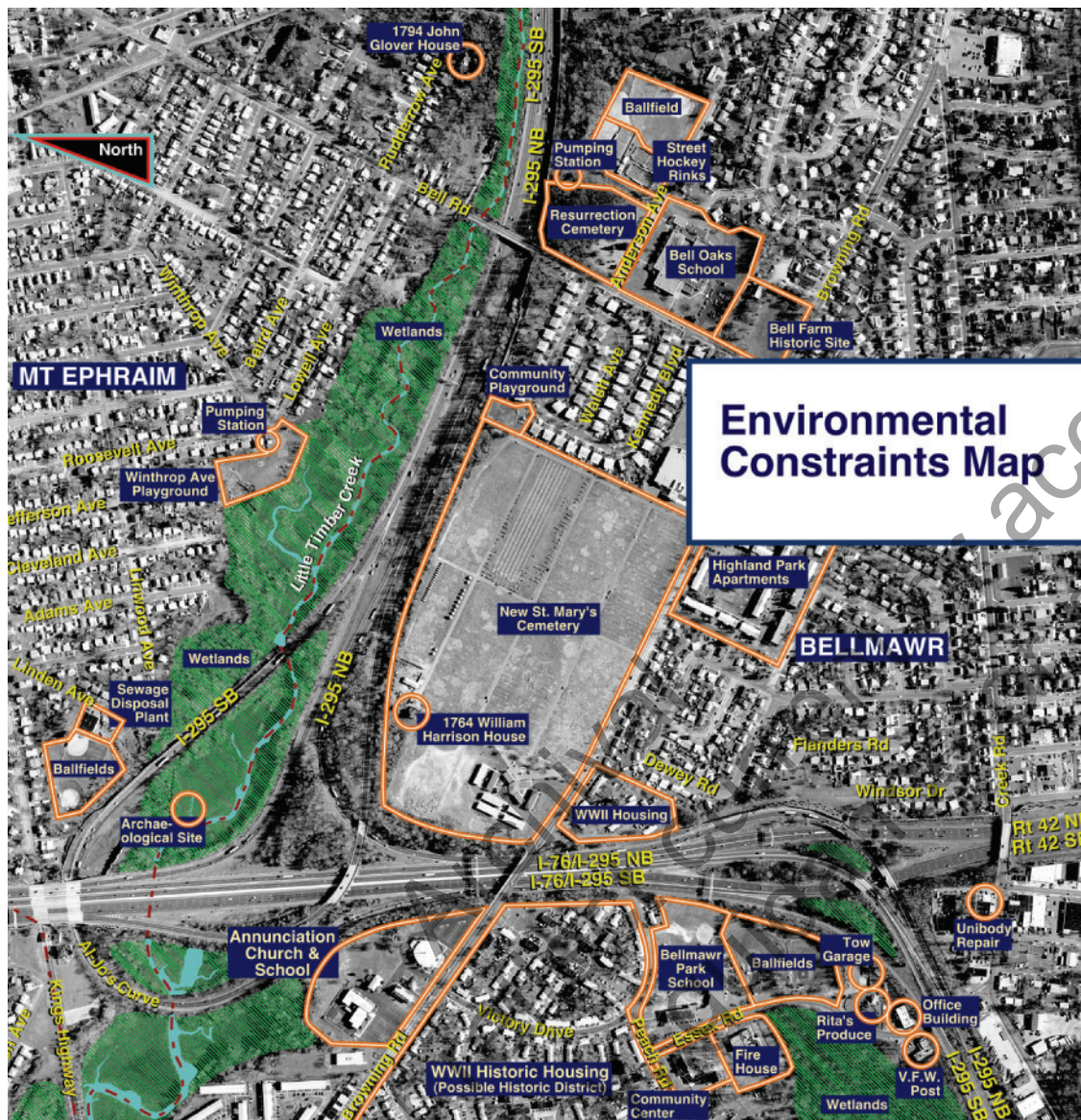
Figure 2. Map of project area.