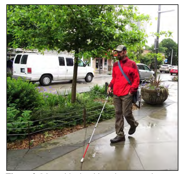
Figure 2. Man with visual impairment navigates on a shared street with aid of a long white cane.

The 2010 Standards for Accessible Design, adopted by the U.S. Department of Justice (USDOJ), address some aspects of rights-of-way projects, particularly the requirement to provide curb ramps at the intersection of newly constructed or altered roads and sidewalks. However, these DOJ standards, and the 2006 Standards adopted by the U.S. Department of Transportation (USDOT), have limited applicability in the public right of way.