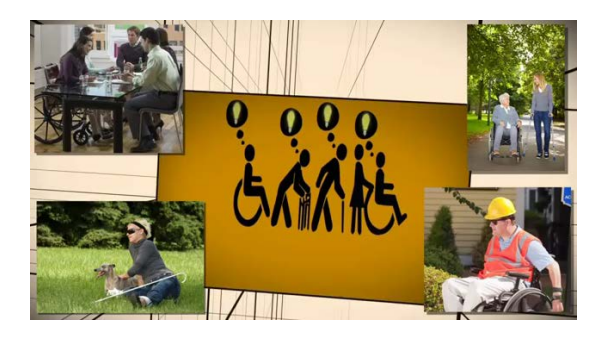
Just as the self-evaluation requires public participation, the development of a transition plan also requires public participation. People with disabilities can offer important insight into

Transition plans are vital for all local public agencies, or LPAs, because they serve as a road map to correct any and all deficiencies in the facilities that you own or for which you are responsible. This pertains to both now and in the future. The transition plan also specifies how you will provide full and equal rights to, and use of, your public rights-of-way to all pedestrians including those with disabilities.