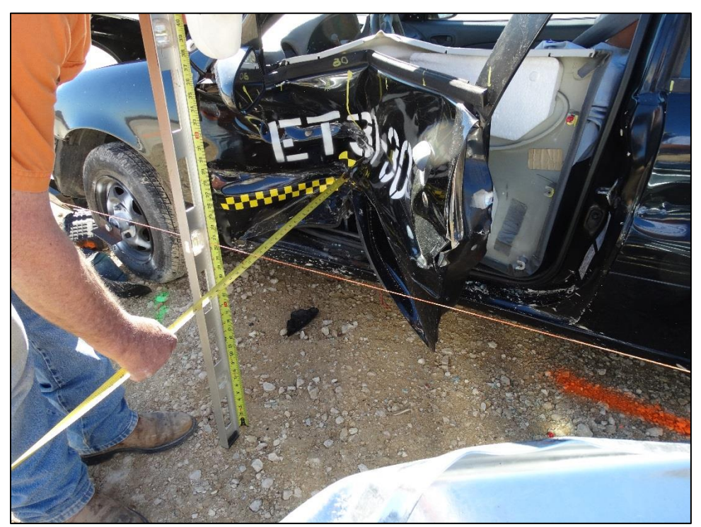
Figure 7: External Measurements - Driver's Side