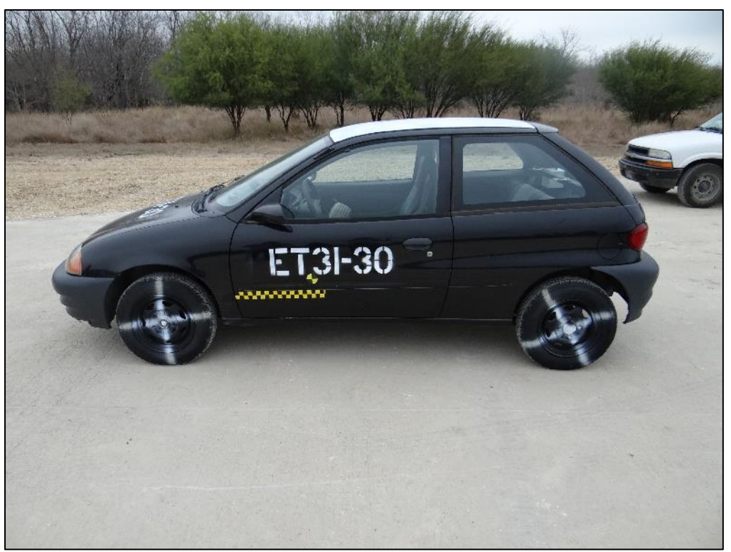
Figure 2: Test ET31-30 Vehicle, Pre-Test