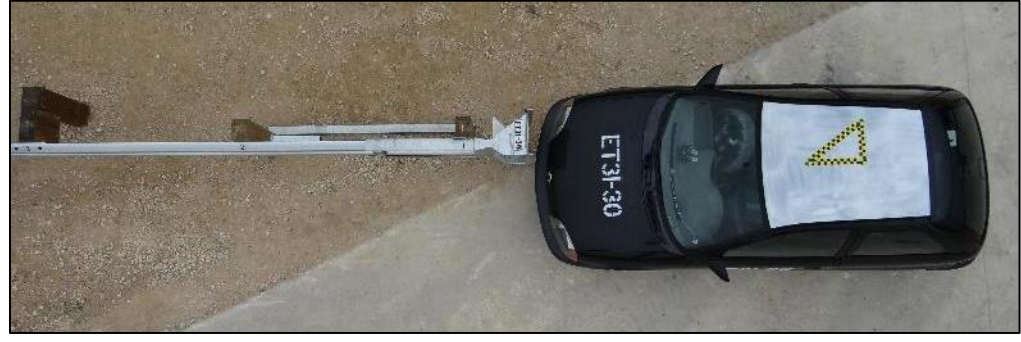
Figure 1: Vehicle Positioned for Test ET31-30, Pre-Test