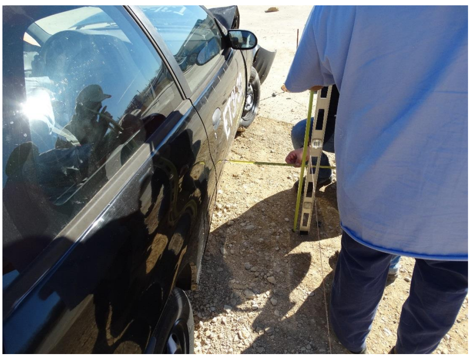
Figure 8: External Measurements - Passenger Side