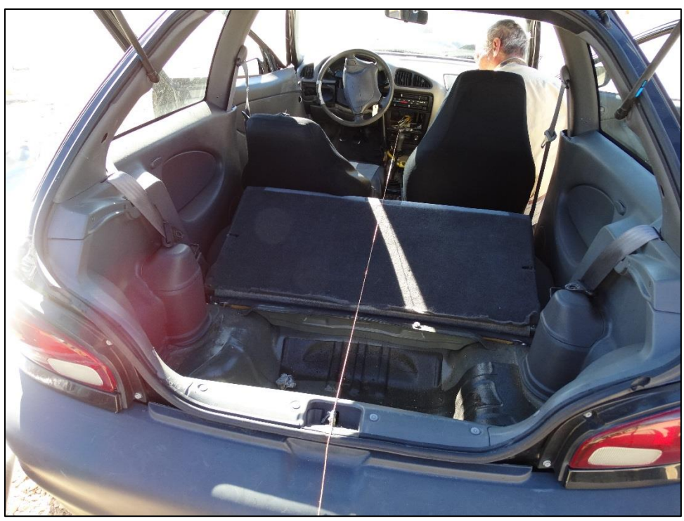
Figure 11: Centerline Strung from Radio Panel to Rear Hatch Latch

These dimensions were later used to relate the location of maximum deformation to the vehicle's center of gravity.