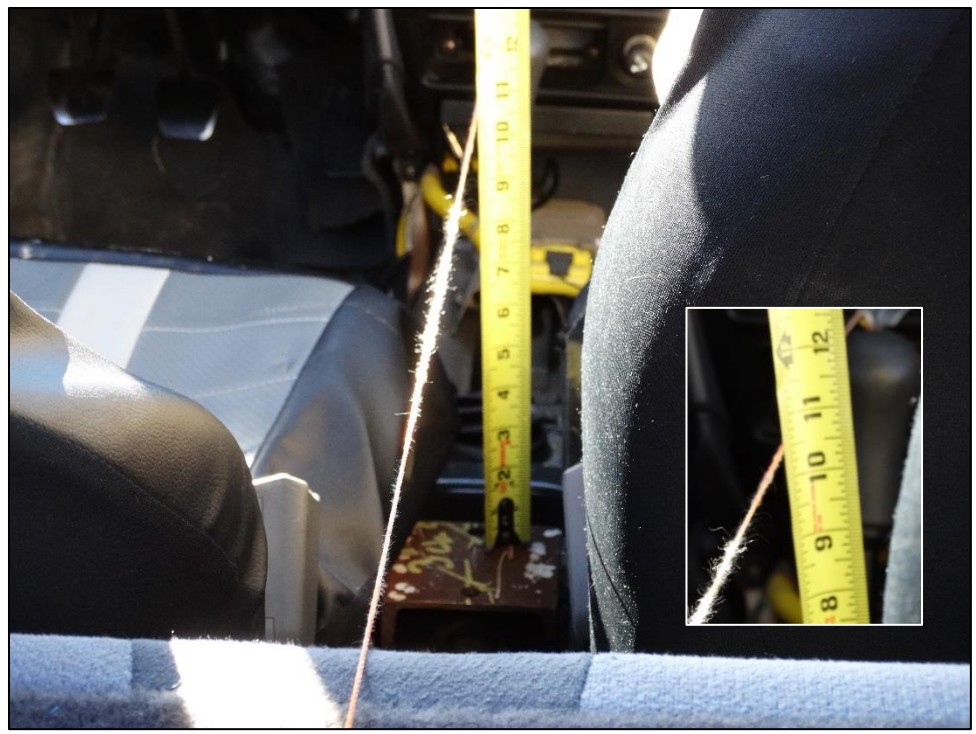
Figure 12: Vertical Location of Centerline Relative to EDR Bracket