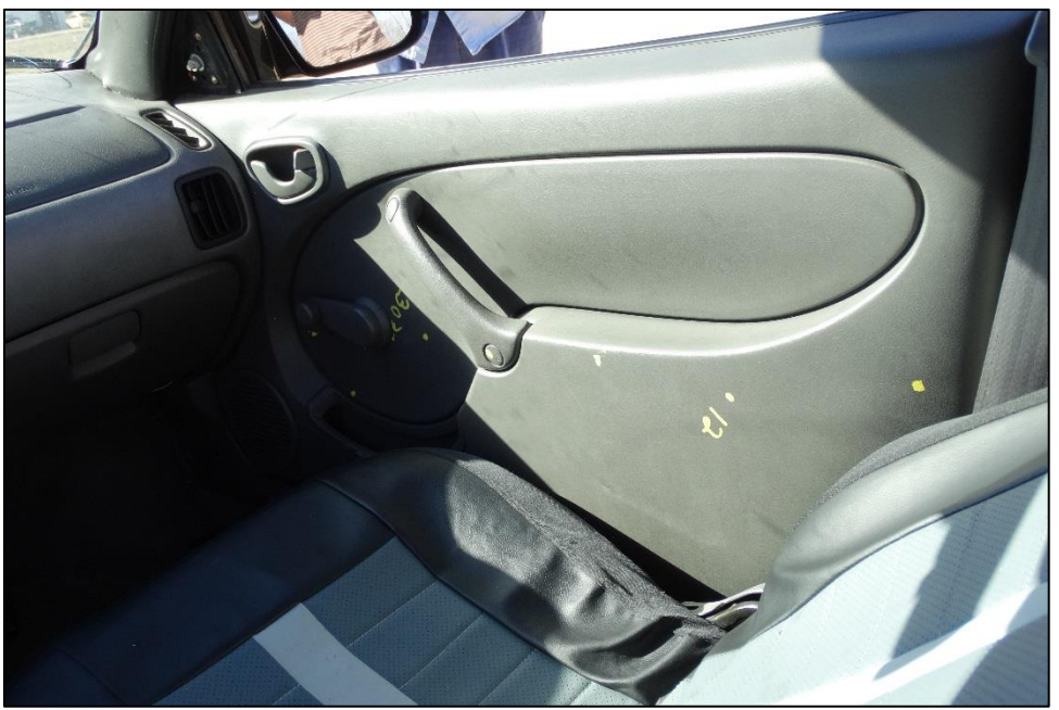
Figure 9: Reference Marks Transferred to Interior Passenger Side Door Panel

Prior to taking interior deformation measurements, the anthropomorphic dummy was removed from the driver's seat of the vehicle through the passenger door to ensure minimal disturbance of the driver's side door. The reference marks shown in Figure 4 were transferred to the interior of the vehicle on the passenger side as shown in Figure 9, and then to the associated location on the driver's side door as shown in Figure 10. Measurements for both the driver and passenger side of the vehicle were made at each of these reference marks.