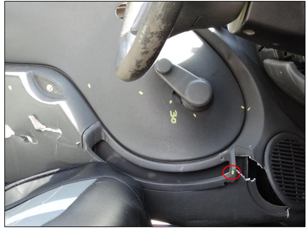
Figure 15: Location of Maximum Occupant Compartment Deformation