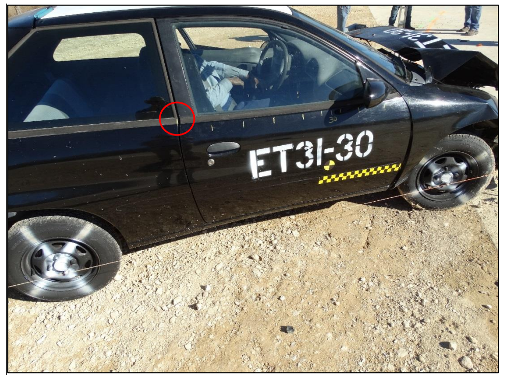
Figure 4: Exterior Reference Marks on Passenger Side Door, B-Pillar Forward

For both internal and external measurements, attention was focused on the front seat area of the vehicle. Reference marks were made on both sides of the vehicle starting at the B-Pillar as shown in Figure 4, and proceeding every 15.2 cm (6 in.) towards the A-Pillar at the front of the vehicle. In the area near the most significant damage, marks were made in 5.1 cm (2 in.) increments.