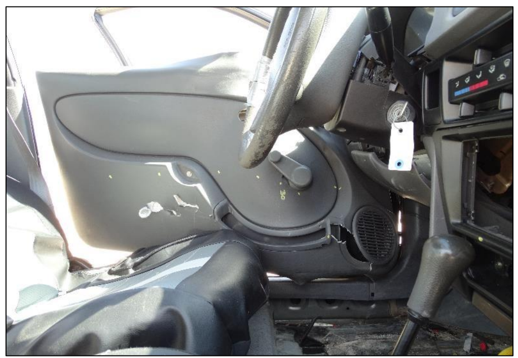
Figure 10: Corresponding Reference Marks on Driver's Side Door Panel