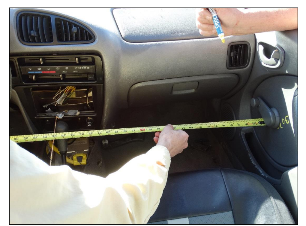
Figure 14: Representative Measurement of Passenger Side Compartment to Centerline

Following the test, internal measurements were made at each of the longitudinal reference marks between the A-Pillar and B-Pillar, and the maximum relative reduction was noted at the lower front corner of the map pocket on the driver's side door, shown in Figure 15. To measure the relative deformation at this location, the top edge of the loose trim on the map pocket was pressed against the door panel as shown in Figure 16, and the resulting measurement to the centerline was compared to the measurement for the corresponding corner of the map pocket on the passenger door. The maximum post-test occupant compartment deformation at the point of maximum compartment reduction was measured to be approximately 17.1 cm (6.75 in.) at a point located approximately 2.2 cm (0.85 in.) below the center of gravity and approximately 5.1 cm (2 in.) aft of the radio panel, roughly even with the height of the front edge of the seat. This measurement Deformation Index<sup>1</sup> (OCDI) rating of LF0000200. Note that all measurements with the exception of the location of maximum reduction were made at the height of the centerline string.