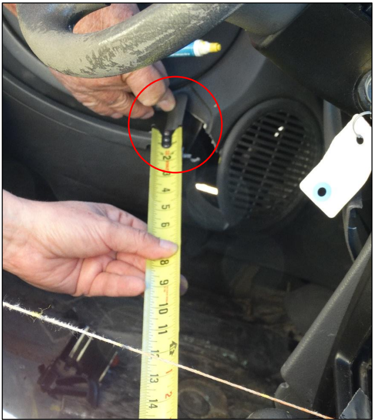
Figure 16: Top Corner of Map Pocket Trim Held against Door Panel for Measurement