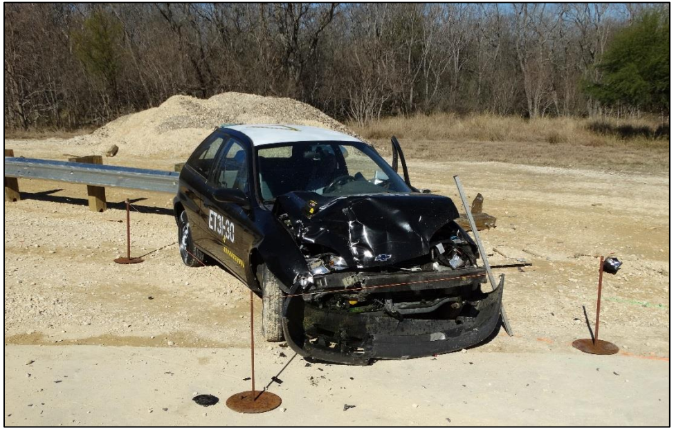
Figure 5: String Line for External Deformation

Before the vehicle was disturbed following the test, external deformation was measured relative to a string line that was positioned parallel to each side of the vehicle. The string was placed 122 cm (48 in.) from the centerline on both sides of the vehicle at a height of 45.7 cm (18 in.), and measurements were recorded from a vertical plane represented by the string line as shown in Figure 7 and Figure 8, and were made at each reference mark between the A-Pillar and B-Pillar. The measurements of external deformation are not used to determine compliance to NCHRP Report 350, and were recorded for reference only.