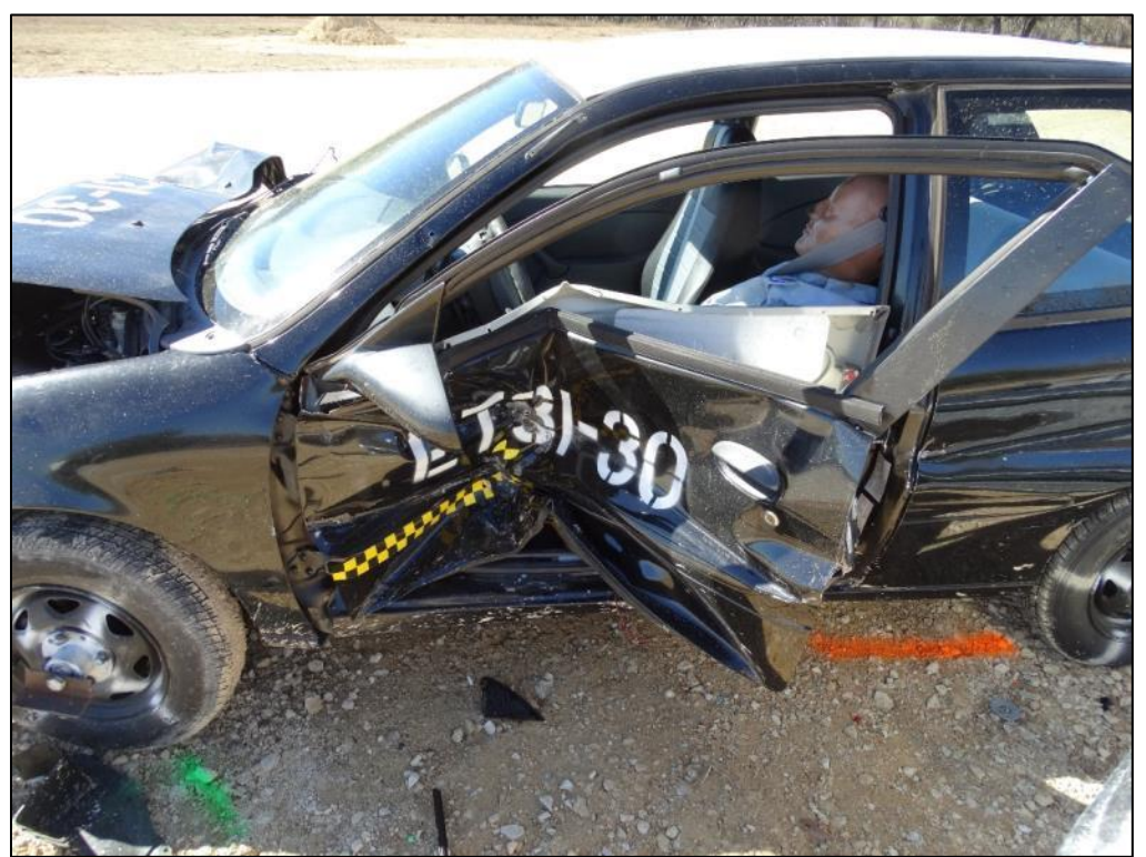
Figure 3: ET31-30 Test Vehicle Post-Test, Driver's Side Exterior