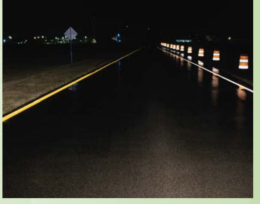
Conventional Pavement Markings