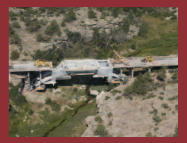
Castlewood Canyon Bridge on SR 83 south of Franktown

—. Asset Management Requirements (March 2002).