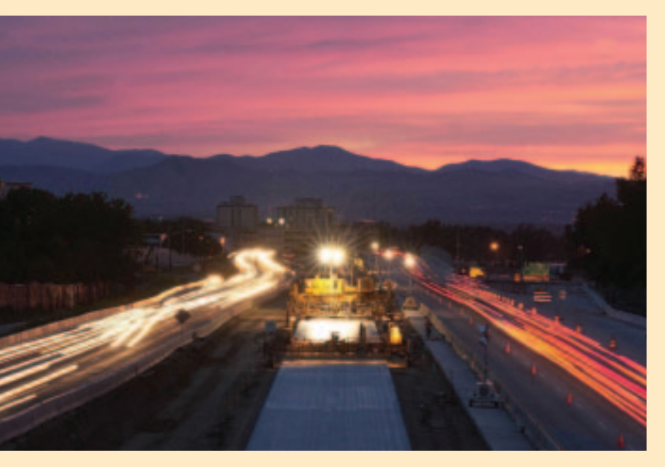
Night paving on the Transportation Expansion Project, I-25 in Denver

The Transportation Asset Management Case Study Series is the result of a partnership between State departments of transportation and the Federal Highway Administration (FHWA) Office of Asset Management. FHWA provides the forum in which to share information, and the individual States provide the details of their experiences. For each case study report, FHWA interviewed State transportation staff, and the resulting material was approved by the State. As such, the reports rely on the agencies' own assessment of their experience. Readers should note that the reported results may or may not be reproducible in other organizations.