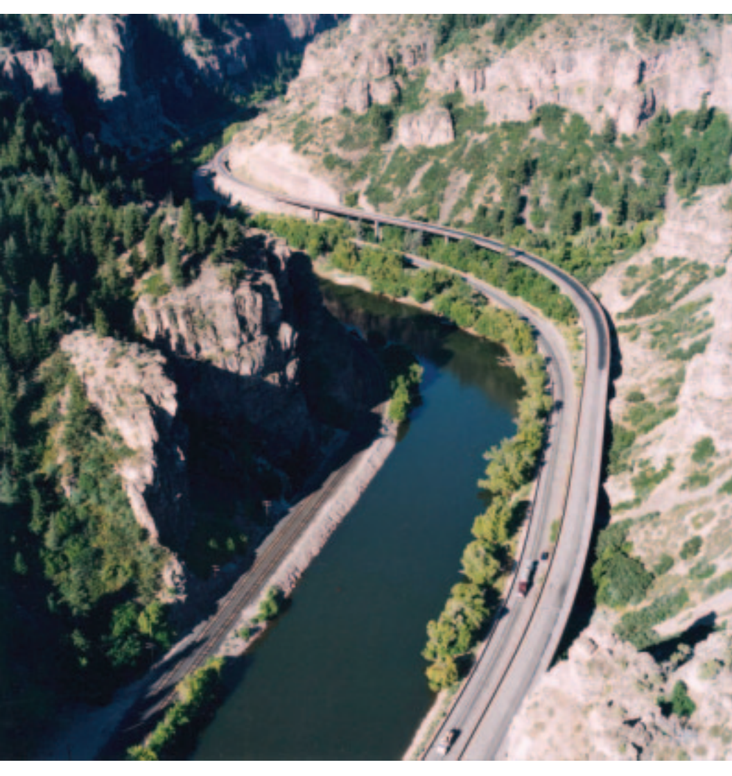
I-70 in Glenwood Canyon, east of Glenwood Springs