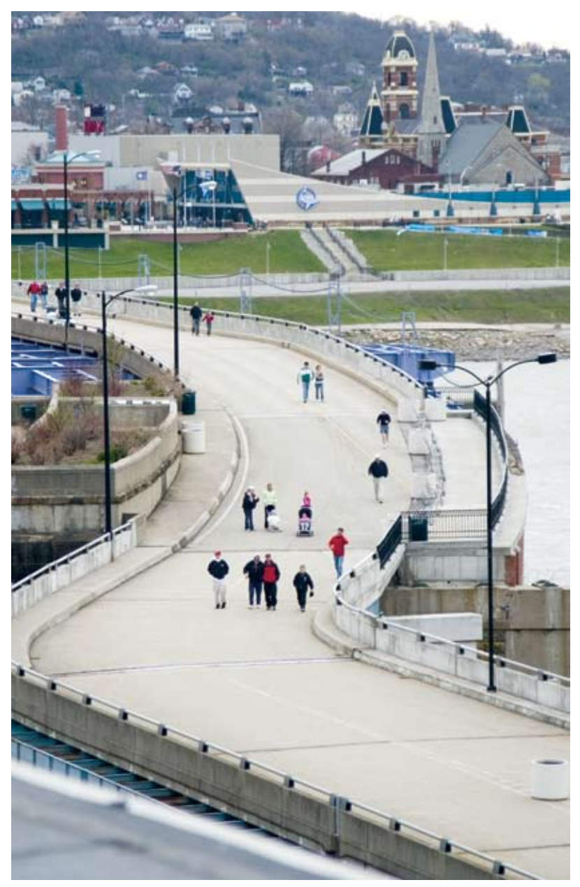
Newport Southbank Bridge connecting Cincinnati, OH and Newport, KY ("Purple People Bridge").