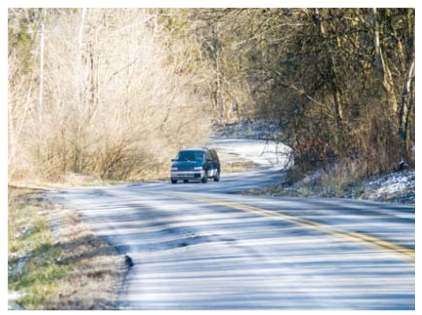
Upper Tug Fork Road, Campbell County, KY.