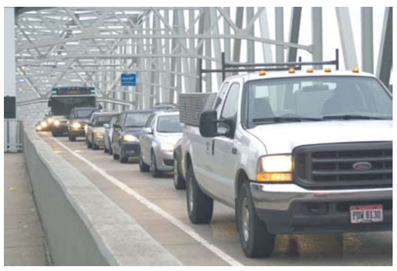
Taylor Southgate Bridge connecting Cincinnati, OH and Newport, KY.

After much effort, OKI is in a strong position to incorporate additional economic analysis methods into its Project Scoring Process and overall Congestion Management Process. OKI will continue to scrutinize its evaluation mechanisms and will, where appropriate, make use of STEAM and smaller scale tools to improve its planning results. The greater use of economic analysis and other advanced planning tools is an ongoing process that has the full commitment of OKI and regional leadership, OKI staff, and the agencies and contractors available to support OKI.