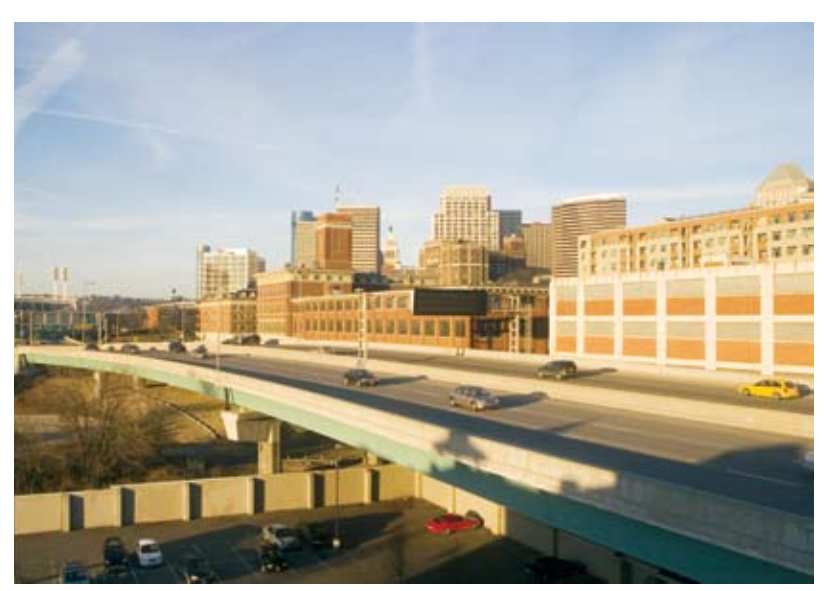
Fort Washington Way (Interstate I-71), Cincinnati, OH.

OKI has long recognized that one solution to reducing the subjectivity of assigning point values to the transportation and planning factors would be to put some factors into dollar terms and apply economic analysis tools to compare the dollar values of benefits to costs directly. For instance, 6 of the 8 transportation factors and the air quality/energy improvements planning factor in the Project Scoring System are directly or indirectly linked to safety and capacity impacts that can be measured monetarily. These factors could be measured in terms of crashes avoided; hours of travel time reduced; and lower vehicle miles and air emissions over the project life cycle. Dollar values could then be assigned to these benefits and the totals compared directly to the dollar value of costs.