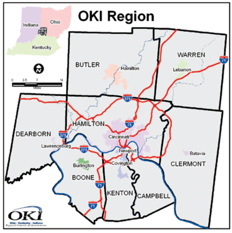
Figure 1: The OKI Region.

Within the eight-county region are the following transportation assets and services: