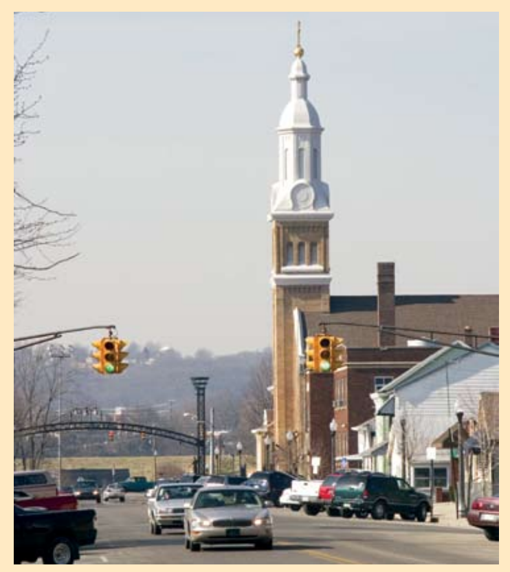
Walnut Street, Lawrenceburg, IN.

The Transportation Asset Management Case Study Series is the result of a partnership between State departments of transportation, local government agencies, and the Federal Highway Administration's (FHWA's) Office of Asset Management. FHWA provides the forum from which to share information, and the individual States and local government agencies provide the details of their experiences. For each case study report, State or local government agency transportation staffs were interviewed by FHWA, and the State or local government agency approved the resulting material. As such, the case studies rely on the agencies' own assessment of their experience. Readers should note that the reported results may or may not be reproducible in other organizations.