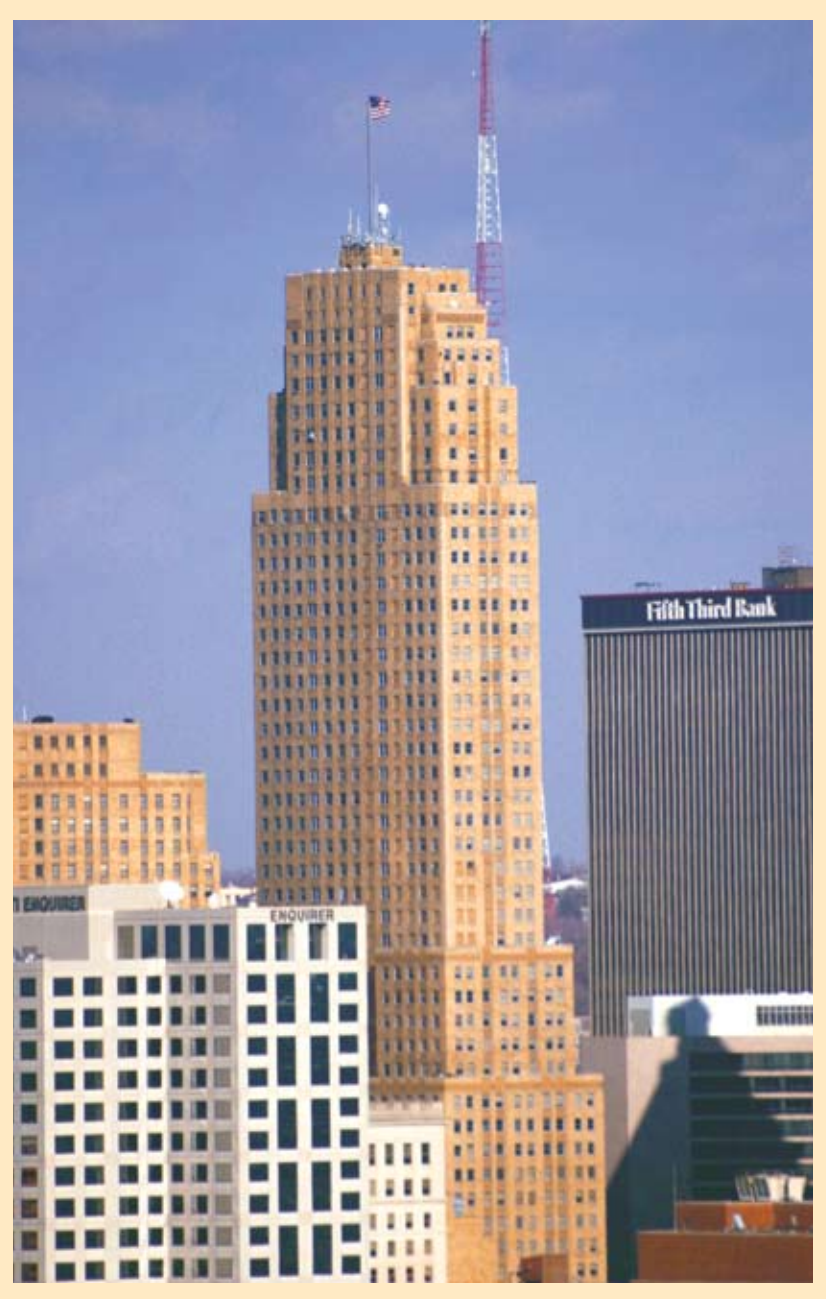
Carew Tower, Cincinnati, OH.