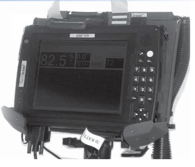
The Intelligent Asphalt Compaction Analyzer measures asphalt pavement density in real time, allowing equipment operators to fix problems before the asphalt hardens.