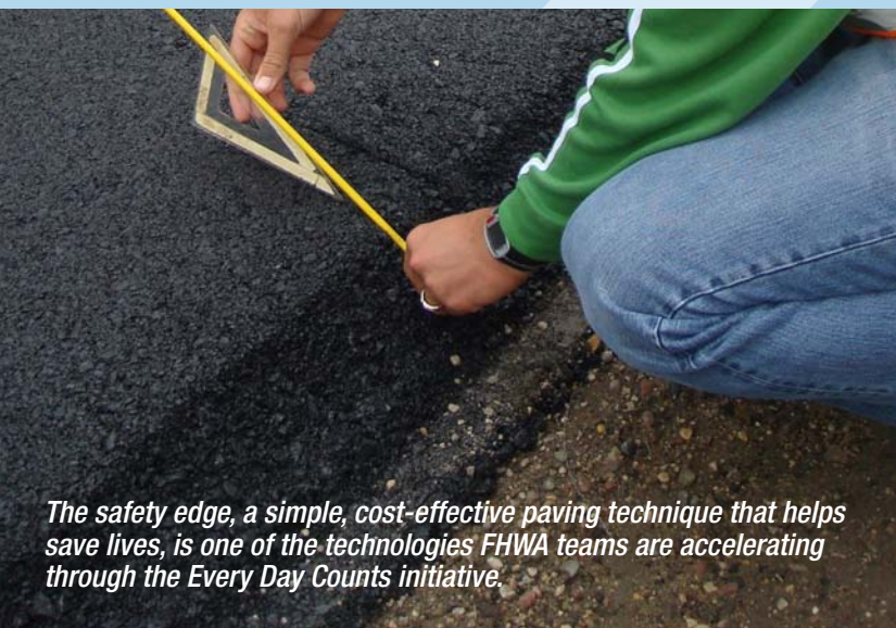
The safety edge, a simple, cost-effective paving technique that helps save lives, is one of the technologies FHWA teams are accelerating through the Every Day Counts initiative.