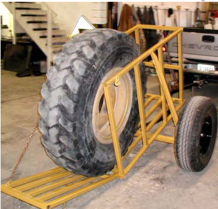
Development of a trailer to transport large tires from heavy equipment won Towner County, N.D., top honors in the Build a Better Mousetrap National Competition.