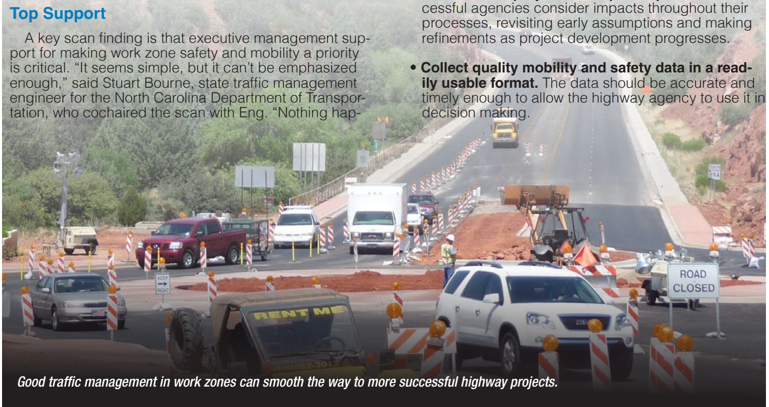
Good traffic management in work zones can smooth the way to more successful highway projects.