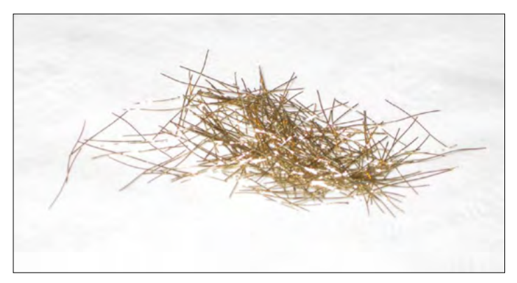
Steel fibers reinforce UHPC, which offers simple, durable connection details for prefabricated bridge elements.