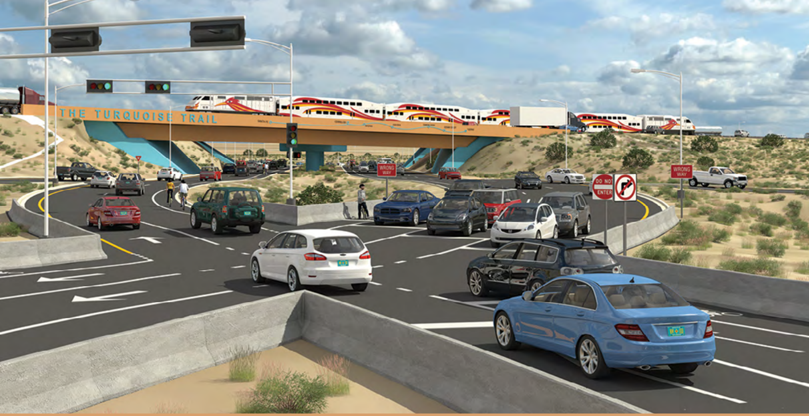
The New Mexico Department of Transportation chose the diverging diamond interchange design to enhance safety and traffic flow.