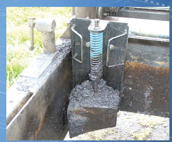
The shoe that creates the Safety Edge is a special edging device that asphalt paving contractors can install on new or existing resurfacing equipment.

After paving with the Safety Edge, the adjacent material should be regraded flush with the top of the pavement. This is considered the best practice, and provides the safest pavement edge. The difference is that when the edge becomes exposed, this shape can be more safely traversed than a vertical edge.