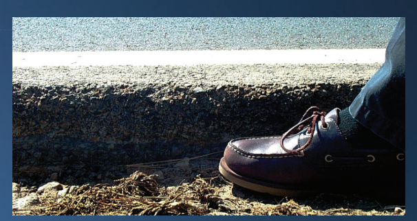
Sharp, steep pavement edge drop-offs can contribute to crashes.