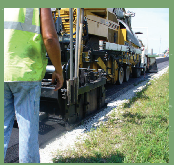
Safety Edge treatment being applied during an asphalt overlay.

The lowa FHWA Division and the lowa Department of Transportation (IDOT) recently began working with counties to install the Safety Edge on projects with a history of roadway departure crashes. The Safety Edge was included at the county level on project plans or incorporated as change orders on alreadylet projects. During one of these county projects, the contractor's safety officer felt positive about the results because the Safety Edge potentially reduced the contractor's liability by providing immediate elimination of the vertical drop-off.