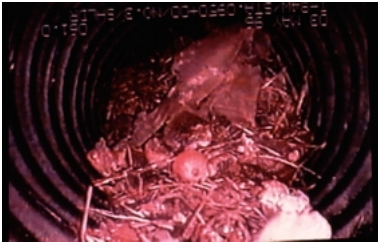
Photo No. 2 Rodent's Nest

Crushed pipe are shown in Photo No. 3 and 4. Most likely these pipe were crushed during construction.