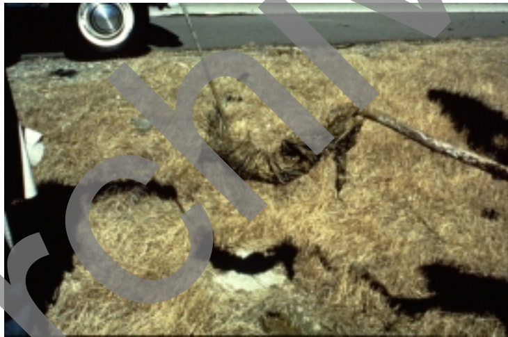
Photo No. 1 Vegetative Material Removed from an Edgedrain System

An example of vegetative material removed from an edgedrain is shown in Photo No. 1, while an edgedrain pipe blocked by a rodent's nest is shown in Photo No. 2.