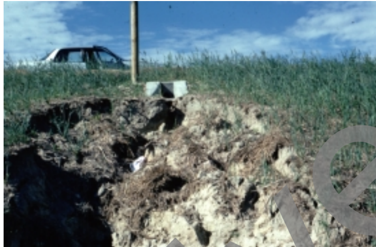
Photo No. 7 Excessive Erosion at the Outlet Pipe

One of the purposes of a headwall is to eliminate erosion at the pipe outlet. Unfortunately, excessive erosion at an edgedrain outlet is shown below in Photo No. 7.