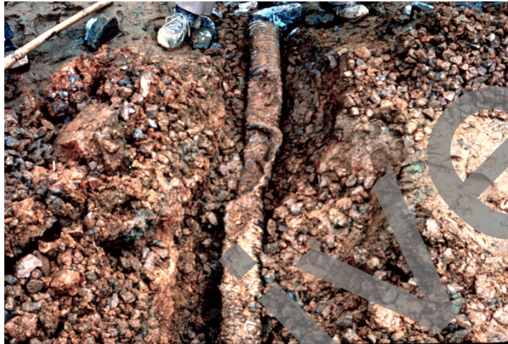
Photo No. 9 Crushed Edgedrain Pipe

Photo No. 9 shows a section of edgedrain that has collapsed. This problem was identified by video inspection.