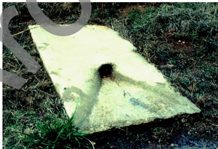
Photo No. 8 Large Outlet Pipe Headwall