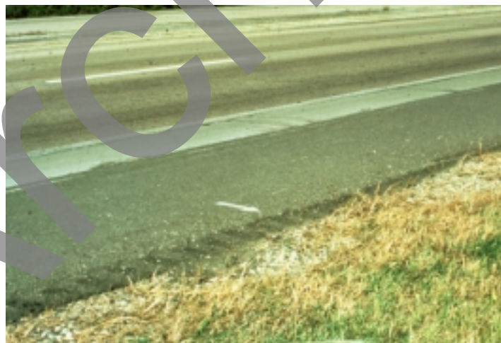
Photo No. 6 Painted Arrow as a Reference Marker

It is obvious that if maintenance personnel can not find the outlets, no maintenance can be performed. SHA's that use concrete headwalls, reference markers, signs on fences, reflector disks in the shoulder, or painted arrows on the shoulders have better success in providing maintenance. It is also important that maintenance activities not block or damage the pipe outlet. A simple arrow painted on the edge of the shoulder, as shown in Photo No. 6, is a good reference marker for maintenance personnel.