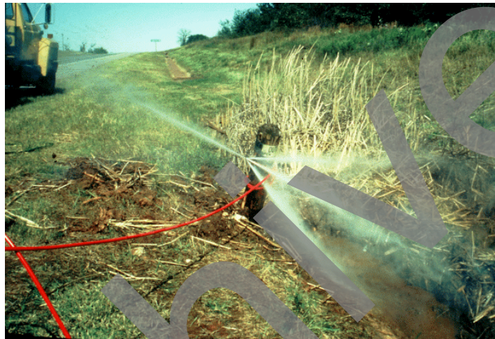
Photo No. 11 Pipe Flushing Unit

A pipe flushing unit is shown in Photo No. 11. The water jets point towards the rear of the unit so that the jetting action helps to propel the unit through the pipe.