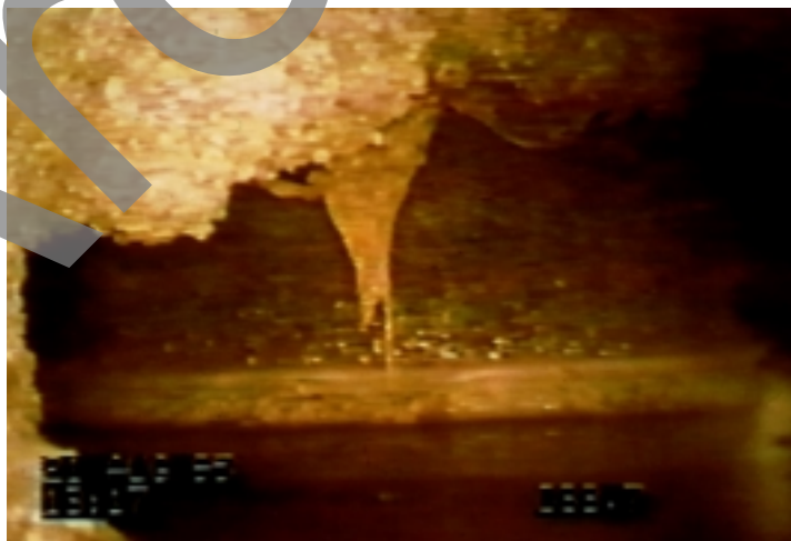
Photo No. 10 Ninety Degree Tee

In Photo No. 10, the video inspection camera is approaching the main line longitudinal edgedrain. It will be difficult for the camera to make this turn from the outlet pipe to the edgedrain. It will also be difficult for any cleaning equipment to make the turn. This is why FHWA recommends large radius pipe or a combination of bends to make the turn.