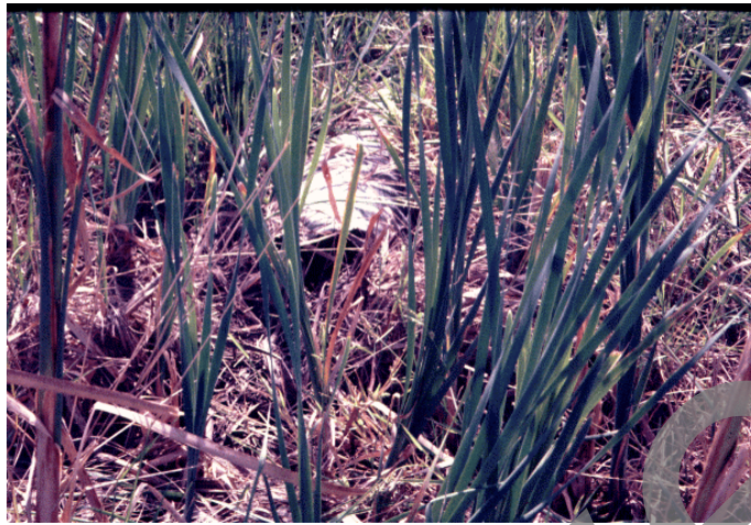
Photo No. 5 Hidden Outlet Pipe

Often outlets cannot be found because they are hidden by vegetative growth. Photo No. 5 shows a typical hidden and crushed outlet. Note that there is no headwall.