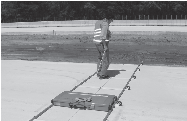
Figure 1. Dowel bar alignment testing using MIT Scan-2.

determining the dowel placement tolerance needed to ensure good pavement performance. This technical brief provides a summary of the current best practices on dowel placement tolerance, including the following key recent developments: