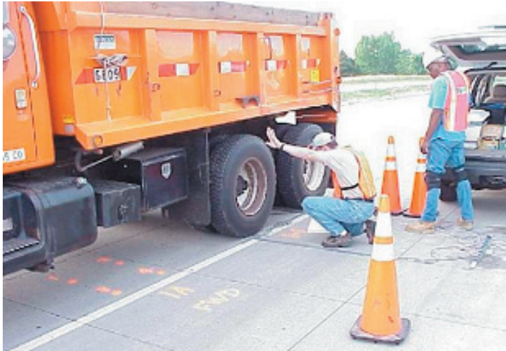
Figure 3. Load testing an instrumented slab with a 180-kN (40-kip) tandem axle (Ardani 2005).

testing was conducted on newly constructed and instrumented TWT pavements. The design procedure was modified based on the new data and analysis results, and the revised guidelines were completed in 2004 (Sheehan, Tarr, and Tayabji 2004).