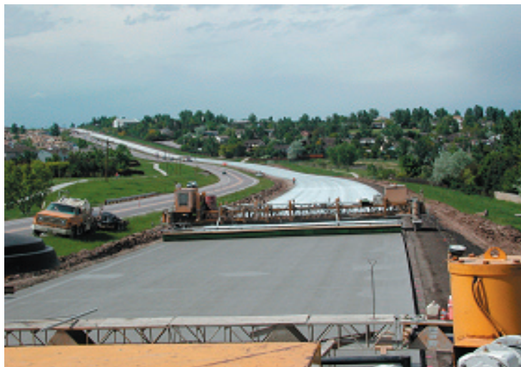
Figure 5. Placing concrete and applying curing compound on SH 121.

The design of the TWT for the Wadsworth Boulevard project included a 150-mm-thick (6-in.) concrete overlay and 1.8-m (6-ft) joint spacing in both directions, placed over the existing AC pavement after milling. The project included all four lanes of a 5.6-km (3.5-mi) stretch of SH 121, including two major intersections and many horizontal and vertical curves in the highway geometry. A total of 130,000 m 2 (155,400 yd 2 ) of TWT was placed in 67 days. A fast-track mix that provided a compressive strength of 17 MPa (2,500 psi) in 24 h was used for intersection paving. The TWT was constructed full width, 11.5 m (38 ft), over the length of the project. The intersections were constructed in three separate 24-h closures. Extensive use of public relations and message boards was a key part of informing the public of closures, and it resulted in positive comments on how fast and efficiently the project was completed. Views of the TWT construction are shown in Figures 5 and 6.