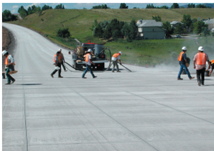
Figure 6. Cleaning (air blasting) joints prior to applying joint sealant on SH 121.