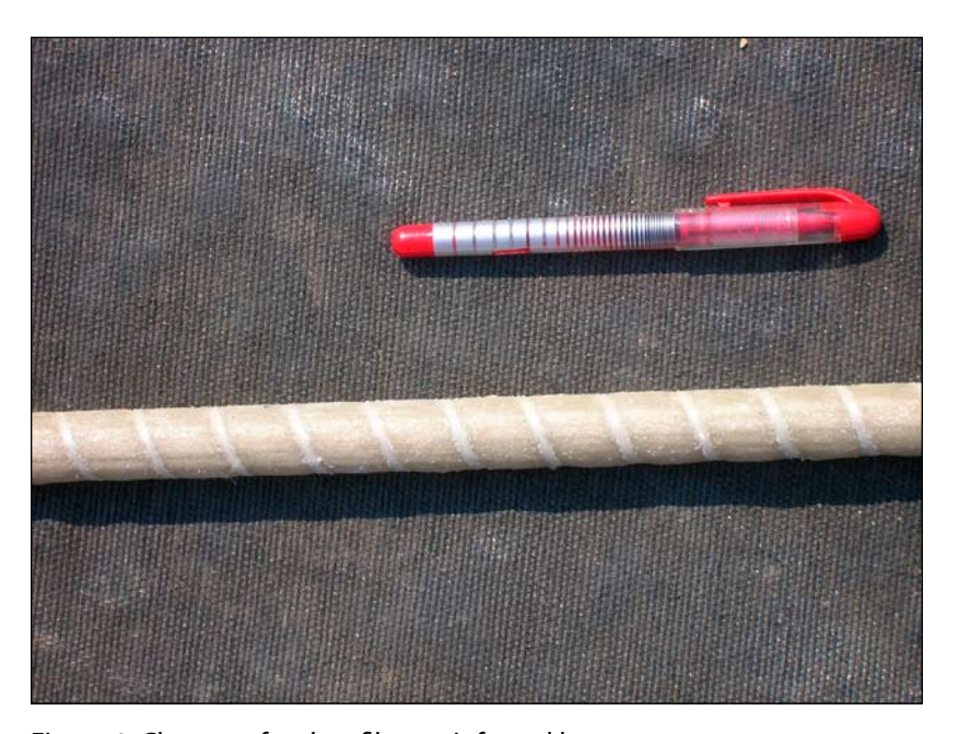
Figure 1. Closeup of a glass fiber-reinforced bar.

Advantages of FRP bars include not only their corrosion resistance, but also their high longitudinal strength, high fatigue endurance, and light weight. In addition, the electromagnetic transparency of FRP bars makes them suitable for use at toll collection booths where electromagnetic vehicle detectors are used (Walton and Bradberry 2005). Disadvantages of FRP bars include their high cost, low modulus of elasticity, and low shear strength.