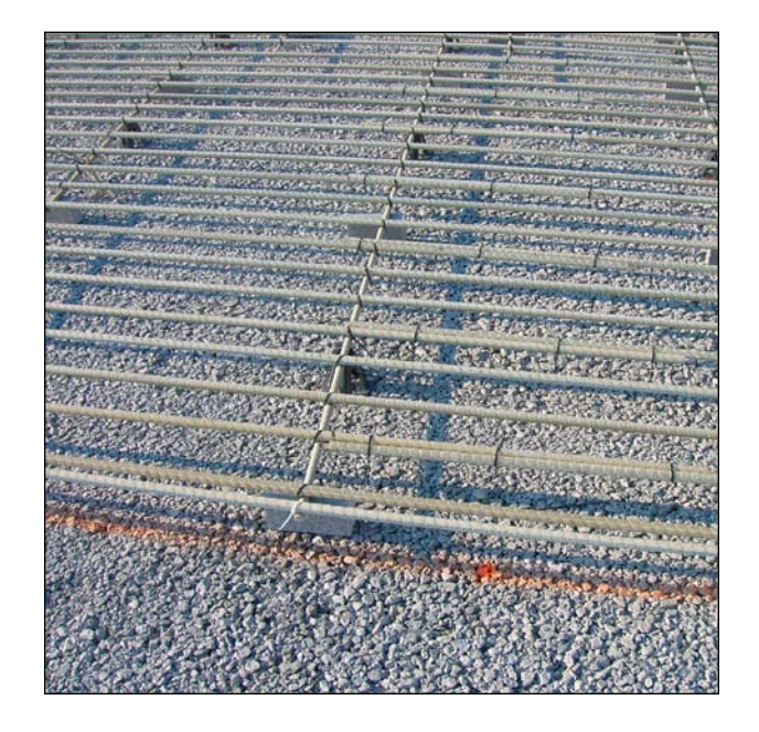
Figure 3. Glass fiber–reinforced polymer bars on grade prior to paving.

section. The researchers monitored the pavements continuously during the first 72 hours to investigate early-age cracking behavior and then obtained experimental results at 7, 28, and 38 days and at 4 months (Chen et al. 2008). Crack width data collected at 4 months showed 0.023 in. (0.58 mm) for the steel-reinforced CRCP and 0.034 in. (0.86 mm) for the GFRP-reinforced CRCP. Crack spacing data collected at about 6 months showed an average spacing of 7.1 ft (2.1 m) for the steel-reinforced CRCP and an average spacing of 12.6 ft (3.8 m) for the GFRP-reinforced CRCP. The greater crack spacing on the GFRP-reinforced CRCP is believed due to the relatively low reinforcement ratio and the use of the cement-stabilized open-graded permeable base, which likely increased the effective slab thickness and thereby further reduced the effective reinforcement content.