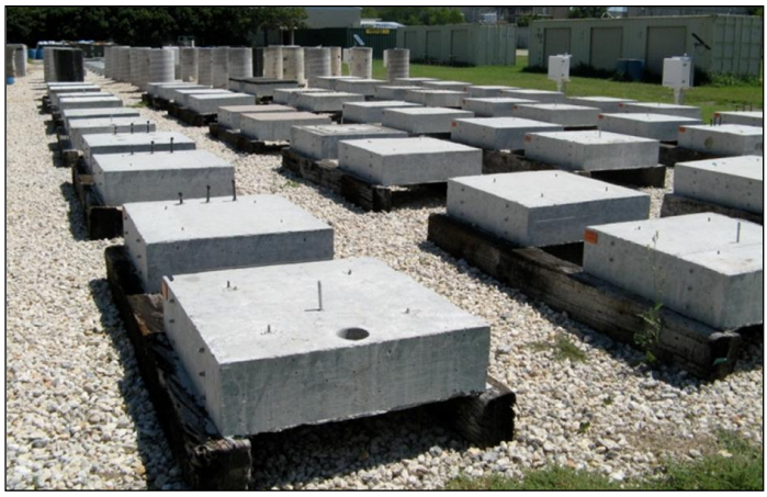
Figure 4. CDC outdoor exposure site.

In conjunction with ICAAR, the ASR Development and Deployment Program Technical Working Group (TWG) will meet on May 23<sup>rd</sup>. The ASR TWG will discuss the overall progress of the program and provide an update on FHWA in-house research. Recent developments from the FHWA ASR Broad Agency Announcement (BAA) program, which seeks to advance the fundamental understanding of ASR, improve laboratory and field tests, and identify cost effective preventive and mitigation techniques, will also be presented.