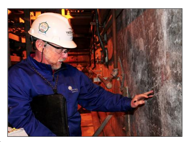
Figure 3. Tunnel affected by ASR.

It was not immediately apparent why ASR was discovered only recently. During the construction phase prior to the plant's opening in 1990, ASR was not predicted by the accepted test methods at the time, ASTM C289 (Standard Test Method for Potential Alkali-Silica Reactivity of Aggregates (Chemical Method)) and ASTM C295 (Standard Guide for Petrographic Examination of Aggregates for Concrete). However, ASTM C09.20 Committee on Normal Weight Aggregates has since cautioned that these tests may not accurately predict aggregate reactivity when dealing with a late or slow-expanding aggregate, which Seabrook engineers have confirmed was used to construct the tunnel.