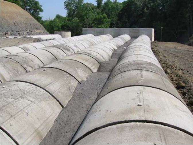
The flowable fill can be seen between the pipes.