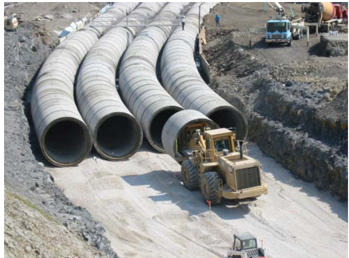
Four 120-inch reinforced concrete pipes being placed.