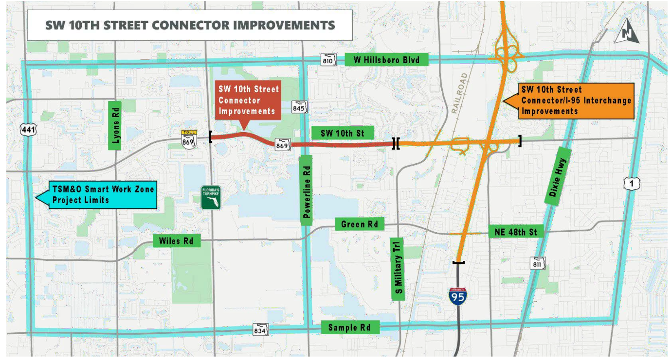
Figure 1: SW 10<sup>th</sup> St Connector Project Components