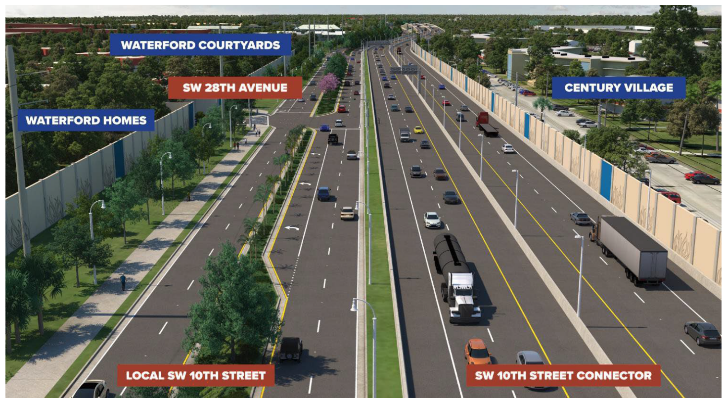
Figure 2: SW 10<sup>th</sup> St Connector and Local SW 10<sup>th</sup> St facilities sharing existing R/W