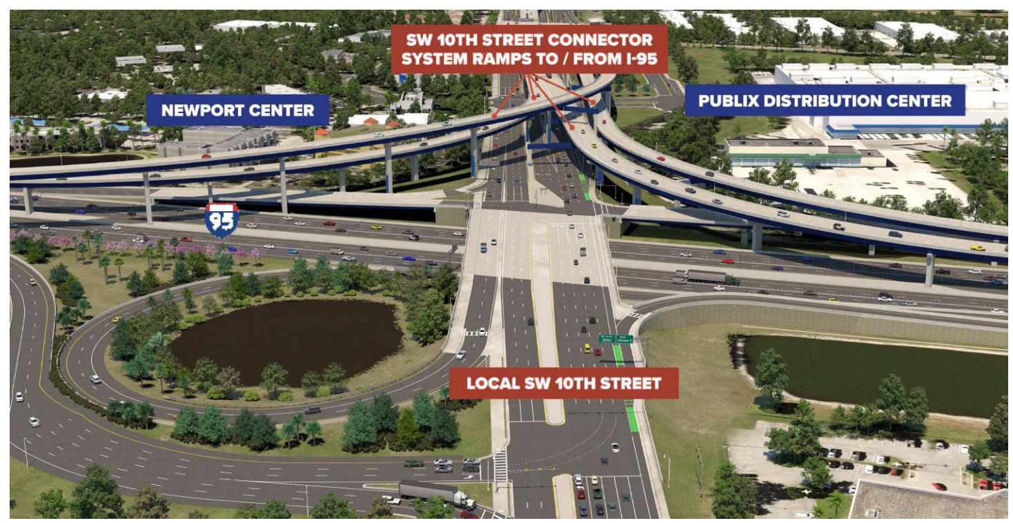
Figure 3: SW 10<sup>th</sup> St Connector at I-95 Interchange reconstruction