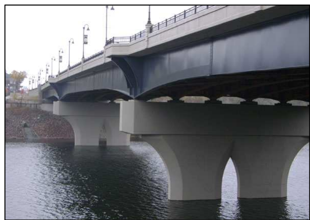
Figure 6 - New TH 23 Bridge