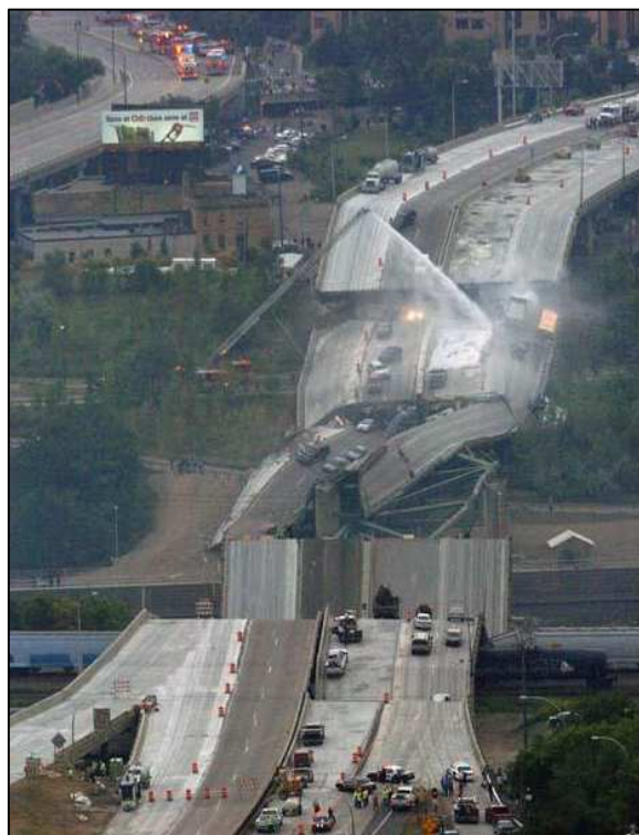
Figure 3 - Bridge Collapse