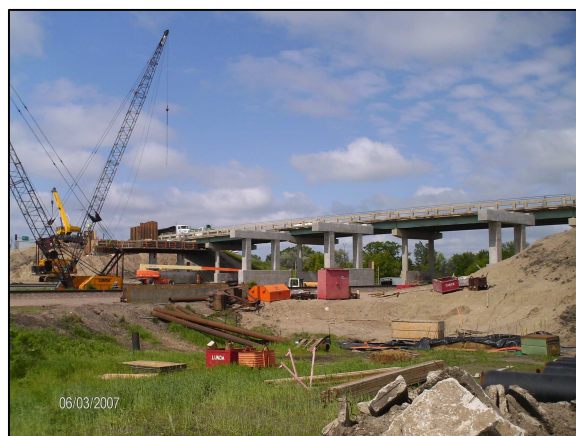
Figure 2 - TH 59 Bridge Construction

To minimize this risk, the contract offered a LID in the amount of $300,000 if the work to open TH 59 to 4 lanes and complete the intersection of TH 10/TH59 was completed by December 1, 2007. The contract also included a disincentive of $5,000 for each day that the contractor did not open the bridge by June 29, 2008. The $300,000 was based on anticipated railroad flagging savings (anticipated at $250,000 if construction extended into 2008) plus $50,000 for reduced road user costs.