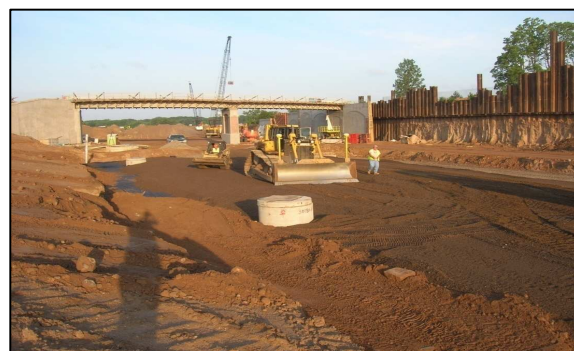
Figure 1 - TH 36 Construction

Very early in the project, Mn/DOT and the City of North St Paul considered options for construction staging. Businesses along TH 36 expressed concern about detouring traffic away from their stores for an extended period of time. North St. Paul high-school had safety concerns about students crossing a work-zone during the school year. Commuters wanted lane closures or full closure lengths minimized.