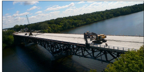
Figure 5 - Old DeSoto Bridge

To meet the schedule goals of the project, the bridge contract included a $1,000,000 LID incentive if the contractor re-opened the new bridge to four lanes by November 1, 2009. The contract also included a disincentive of $20,000 for each day that the contractor did not open the roadway by November 1, 2009.