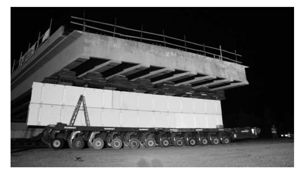
SPMTs are multi-axle computer controlled vehicles that can move in any horizontal direction and also have vertical lift.

FDOT and the Federal Highway Administration (FHWA) hosted a delegation of about 100 transportation officials from across the United States and Canada at a conference held June 9–11, 2006, in DeLand, Florida. Participants learned more about the use of SPMTs for bridge construction and observed the installation of the final span of the Graves Avenue Bridge. "The use of SPMTs provides an effective and efficient solution for bridge replacements on high-volume roads, significantly reducing traffic disruptions and increasing worker safety due to the reduced onsite construction