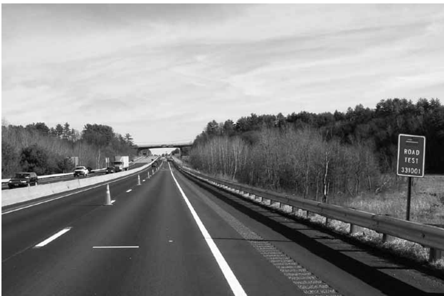
Since the LTPP program began in 1987, data have been collected on the performance of nearly 2,500 in-service pavement test sections throughout the United States and Canada.

To obtain a copy of SDR 25, contact LTPP Customer Support Services at 202-493-3035 (email: ltppinfo@dot.gov ). For more information about the LTPP program, visit www.fhwa.dot.gov/research/tfhrc/programs/infrastructure/pavements/ltpp . Information about LTPP products and online access to the LTPP database are available at www.ltpp-products.com . *