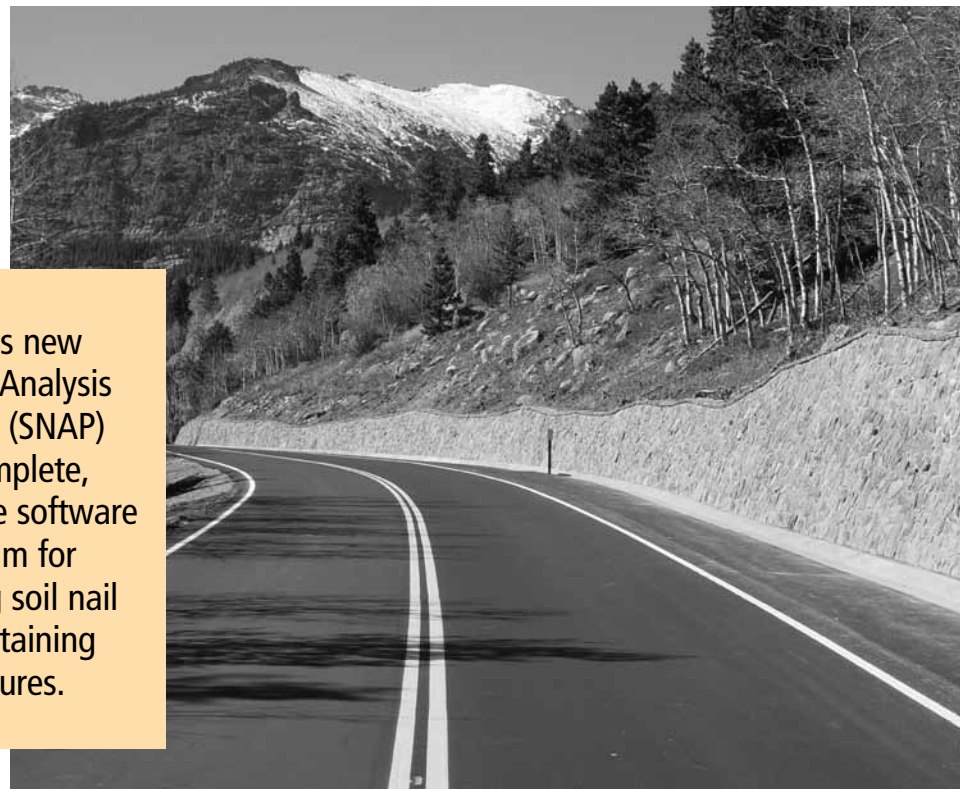
A soil nail earth retaining structure built by FHWA's Central Federal Lands Highway Division in Rocky Mountain National Park near Estes Park, CO.

FHWA's new Soil Nail Analysis Program (SNAP) is a complete, easy-to-use software program for designing soil nail earth retaining structures.