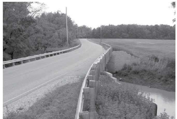
The Bowman Road Bridge in Defiance County, OH, was the first bridge in the world to use the Geosynthetic Reinforced Soil Integrated Bridge System (GRS-IBS).