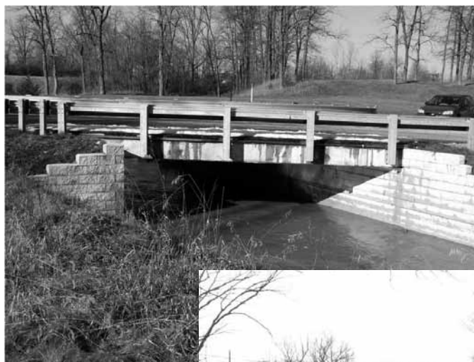
GRS-IBS bridges built in Defiance County, OH, include the Vine Street Bridge (top) and the Tiffin River Bridge (bottom).

The GRS technology is extremely durable and, if properly constructed, can perform well in earthquakes. Other advantages include that the GRS-IBS can be built with readily available materials, using common construction equipment, and without the need for highly skilled labor. GRS-IBS also offers convenience