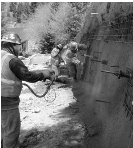
Soil nails are installed as part of an FHWA Central Federal Lands Highway Division project in Guanella Pass near Georgetown, CO.

External failure mode analyses include global stability, sliding, overturning, and bearing capacity. Users can also choose to include the effects of seismic forces in the program's external stability calculations.