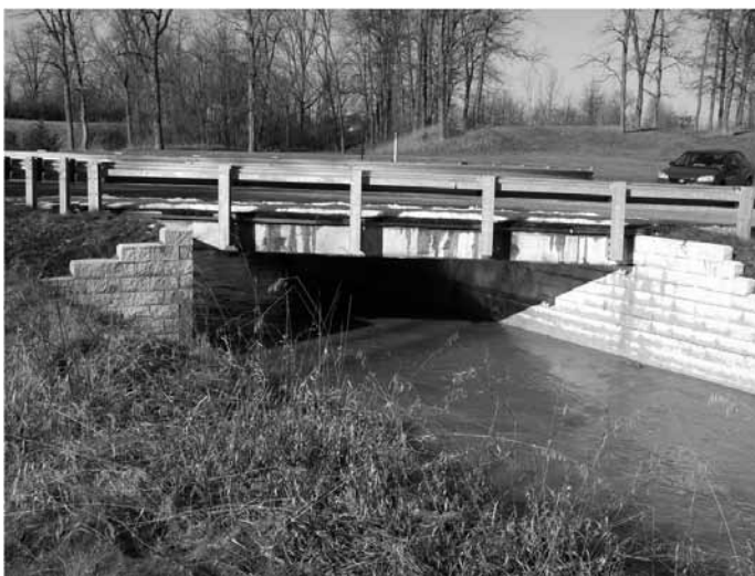
Bridges built using the Geosynthetic Reinforced Soil Integrated Bridge System (GRS-IBS) include the Vine Street Bridge in Defiance County, OH.

"Once the construction process starts, you can quickly see how easy the concept