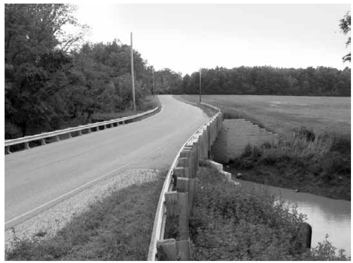
The Bowman Road Bridge in Defiance County was the first bridge in the world to use GRS-IBS.