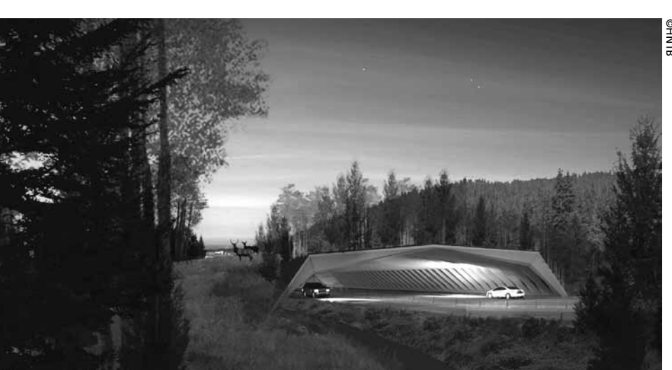
The winning design for the first ARC International Wildlife Crossing Infrastructure Design Competition features a single 100-m (328-ft) concrete span. The bridge is planted with a variety of vegetation types to attract different species to cross.