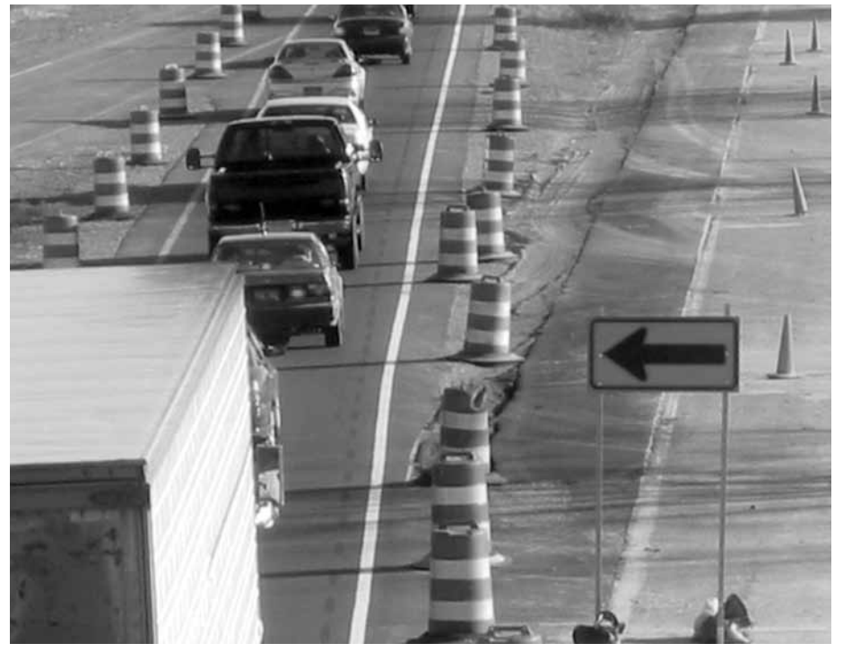
For work zone safety resources, States and contractors can turn to products developed through FHWA's Work Zone Safety Grant program, including guidelines, publications, and training modules.

To learn more about FHWA's work zone safety and mobility resources, visit www.ops.fhwa.dot.gov/wz. Information is also available by contacting Chung Eng at FHWA, 202-366-8043 (email: chung. eng@fhwa.dot.gov).